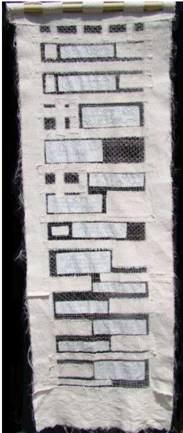
Figure 12. Process , canvas duck cloth and muslin, 68"x18"x1 1/2", 2009.