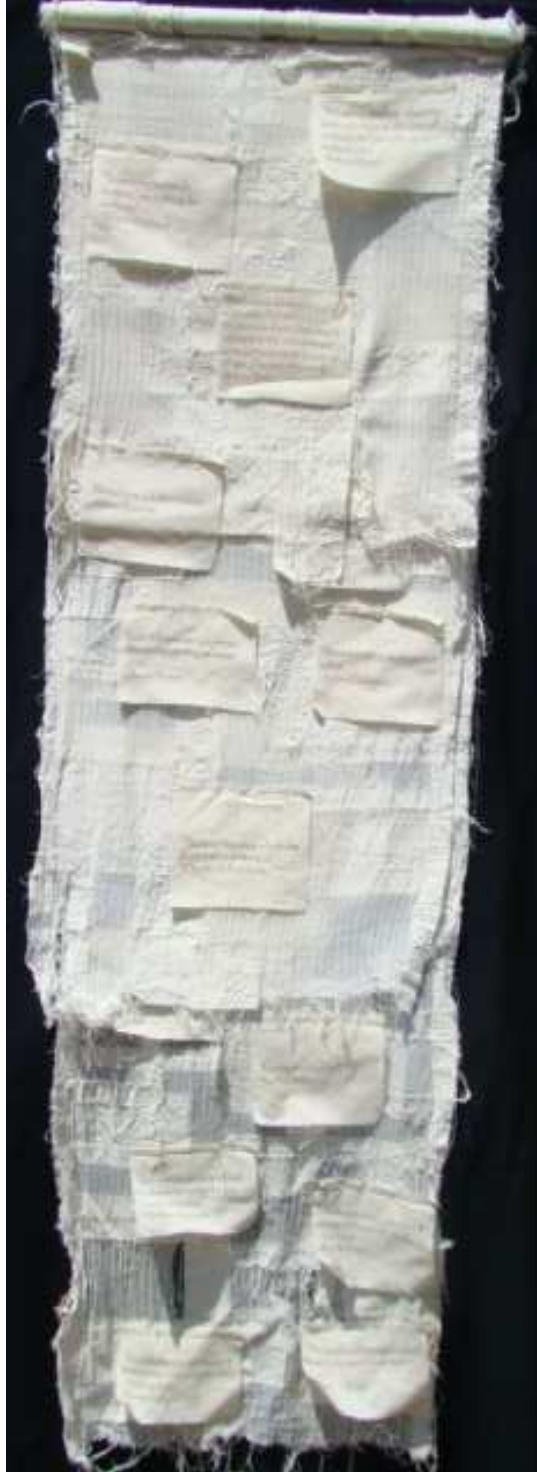
Figure 10. Literature , muslin and cheesecloth, 72"x18"x1 1/2", 2009.