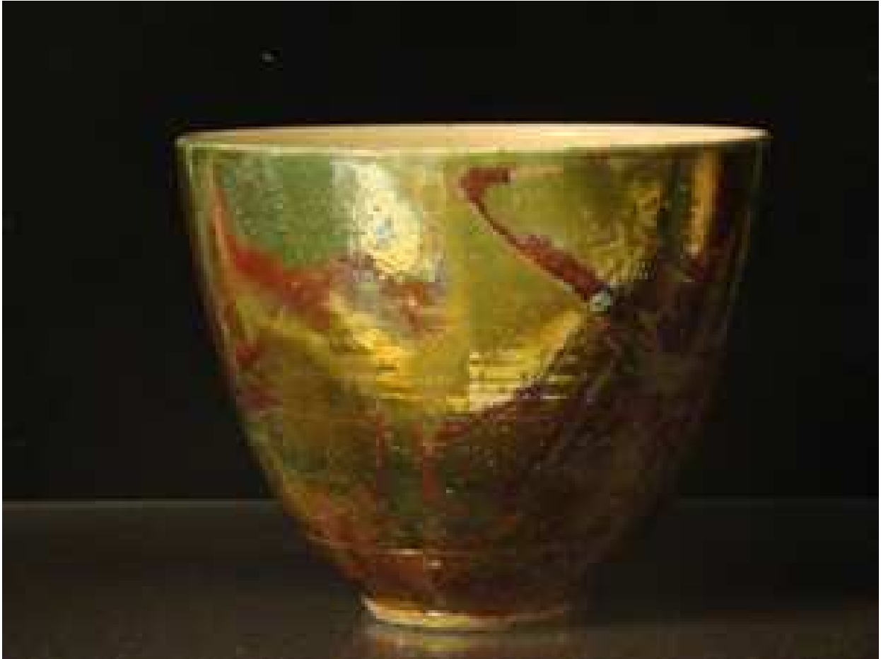
Figure 3. Green Raku Bowl , raku clay and glazes, 6"x7 ½"x7 ½", 2009.