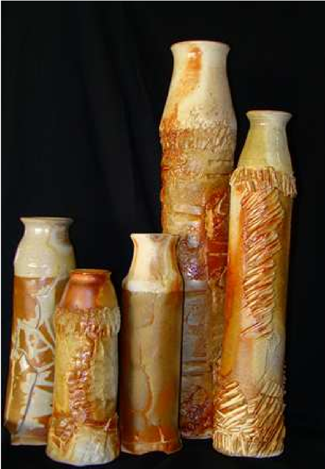
Figure 4. Anagama Bottle Grouping , from left to right: 14 ½"x3 ½"x3 ½", 12"x3 ½"x3 ½", 14"x3 ½"x3 ½", 28"x4 ½"x4 ½", 23"x3 ½"x3 ½", stoneware clay, white Shinto and natural ash glazes, 2008.