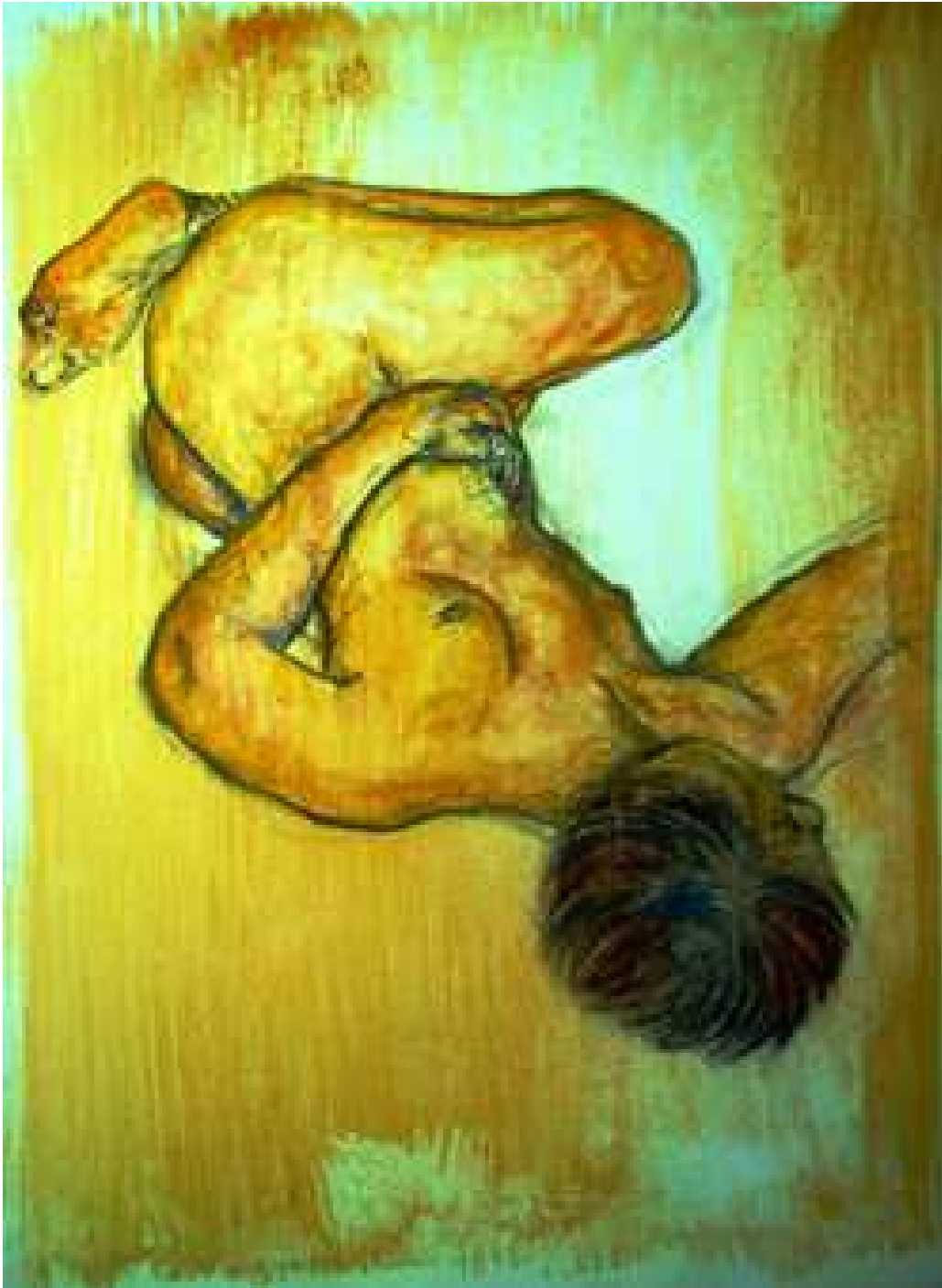
Figure 15. Yellow Reclining , mixed media on Stonehenge paper, 36"x24", 2010.