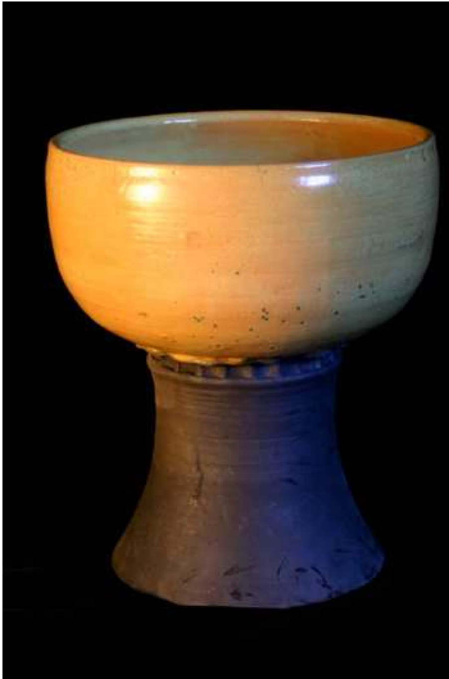
Figure 1. Yellow Pedestal Bowl , raku clay and commercial glaze, 14"x9"x9", 2009.