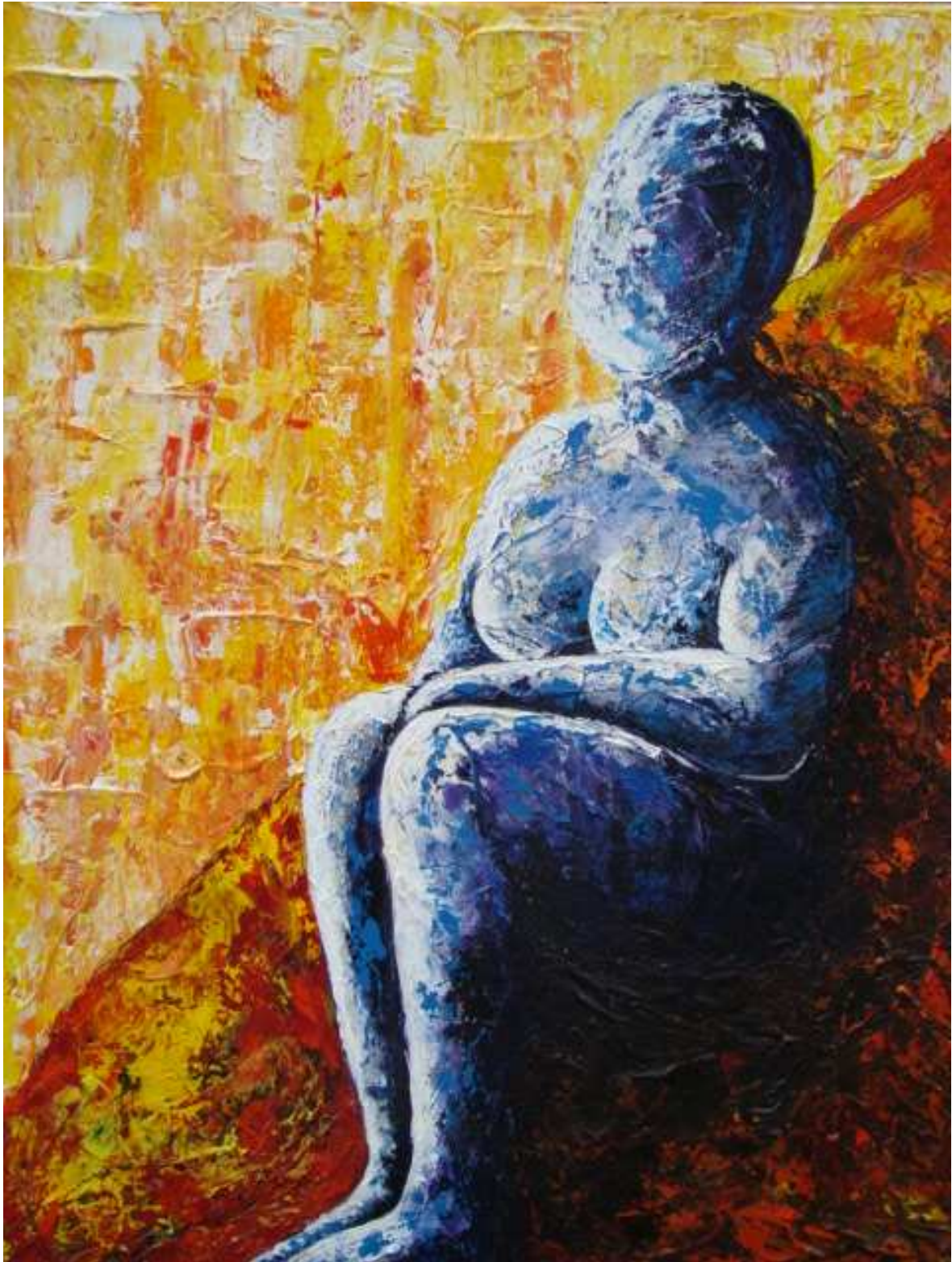
Figure 7. Stoic , acrylic on canvas, 36"x30", 2009.