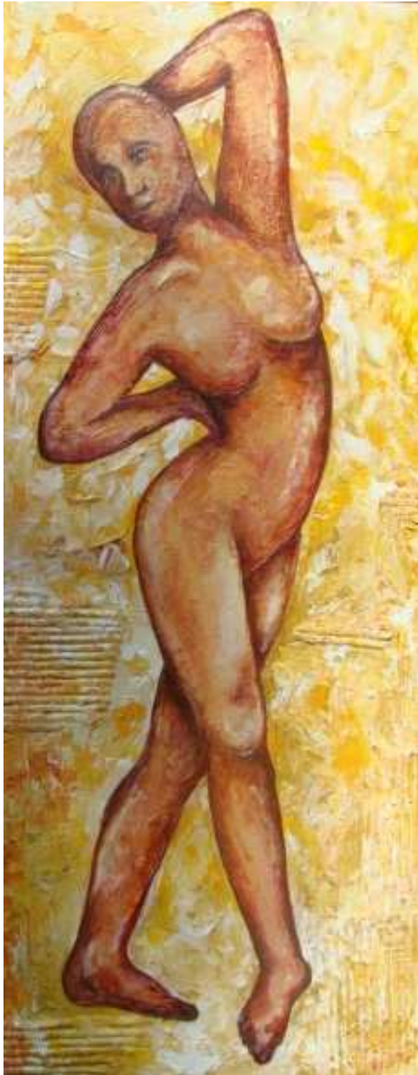
Figure 8. Yellow Dreams , acrylic on canvas, 48"x18", 2009.