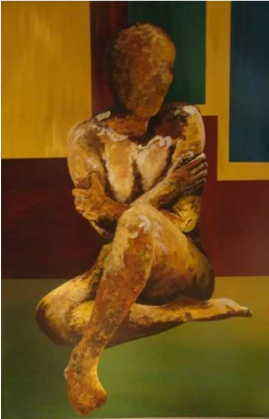
Figure 6. Security , acrylic on canvas, 40"x32", 2008.