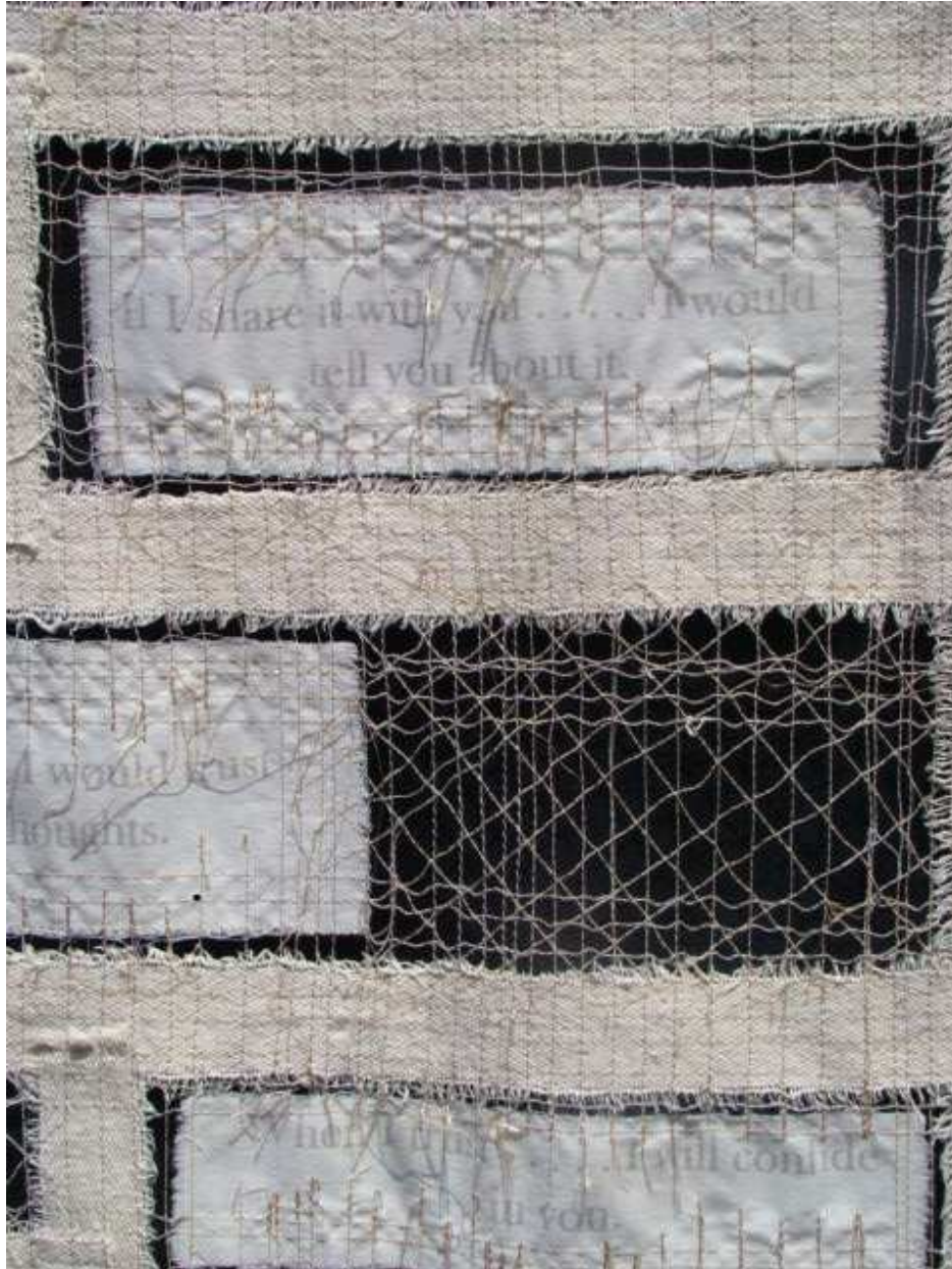
Figure 13. Process (Detail), canvas duck cloth and muslin, 68"x18"x1 1/2", 2009.