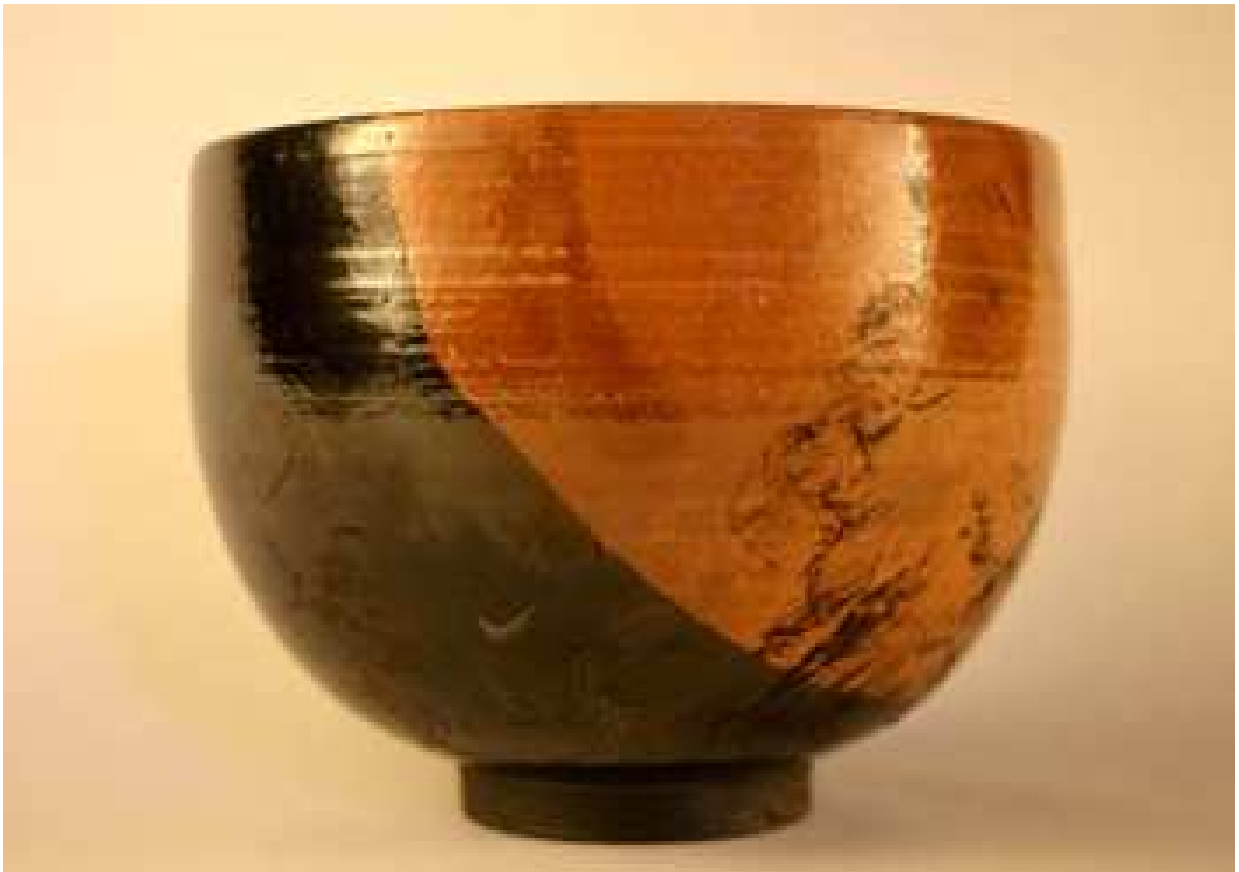
Figure 2. Small Raku Bowl , raku clay and commercial glazes, 5"x6"x6", 2009.