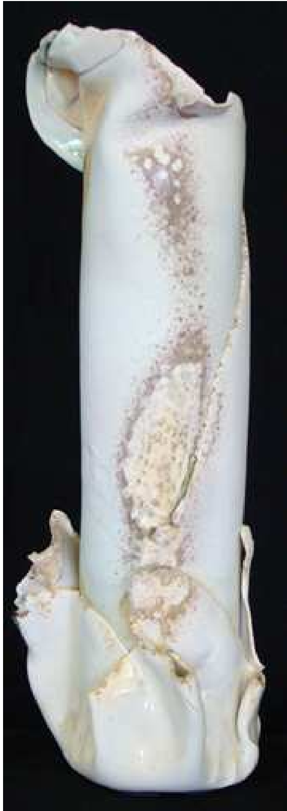
Figure 5. Porcelain Slab Vase , porcelain clay and commercial green glaze, 34''x6''x6'', 2008.