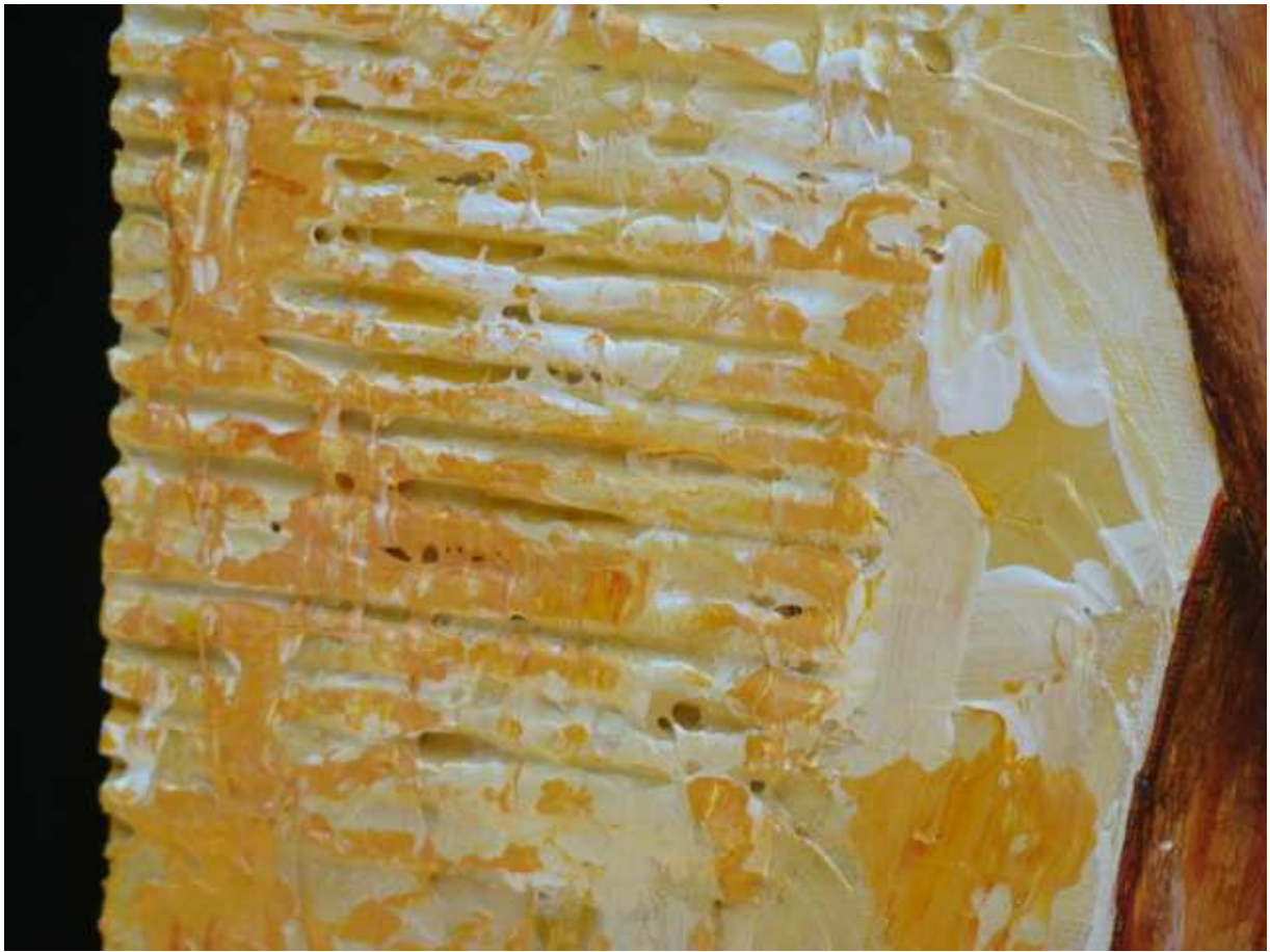
Figure 9. Yellow Dreams (Detail), acrylic on canvas, 48"x18", 2009.