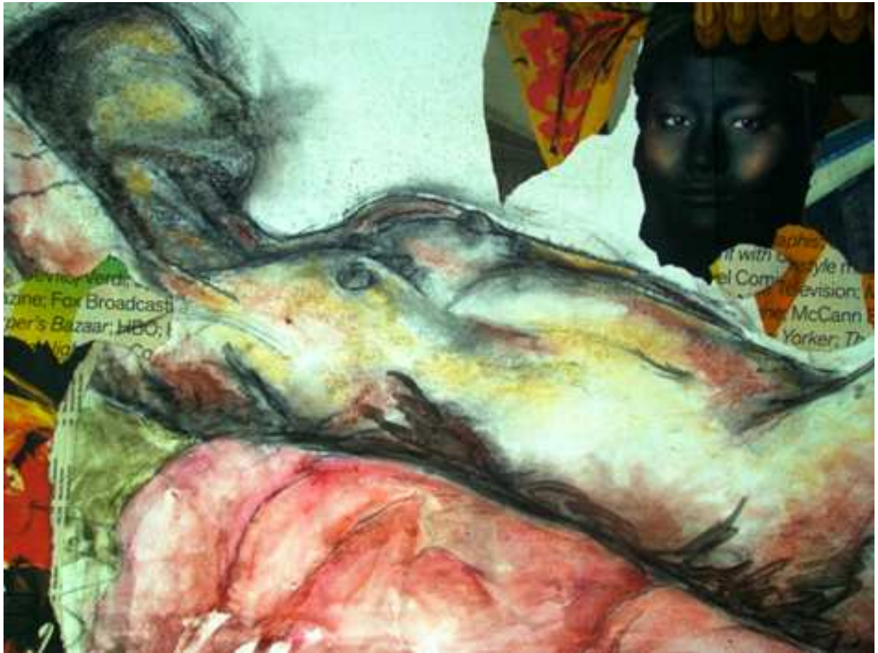
Figure 14. Intrusion , mixed media on Stonehenge paper, 24"x36", 2010.