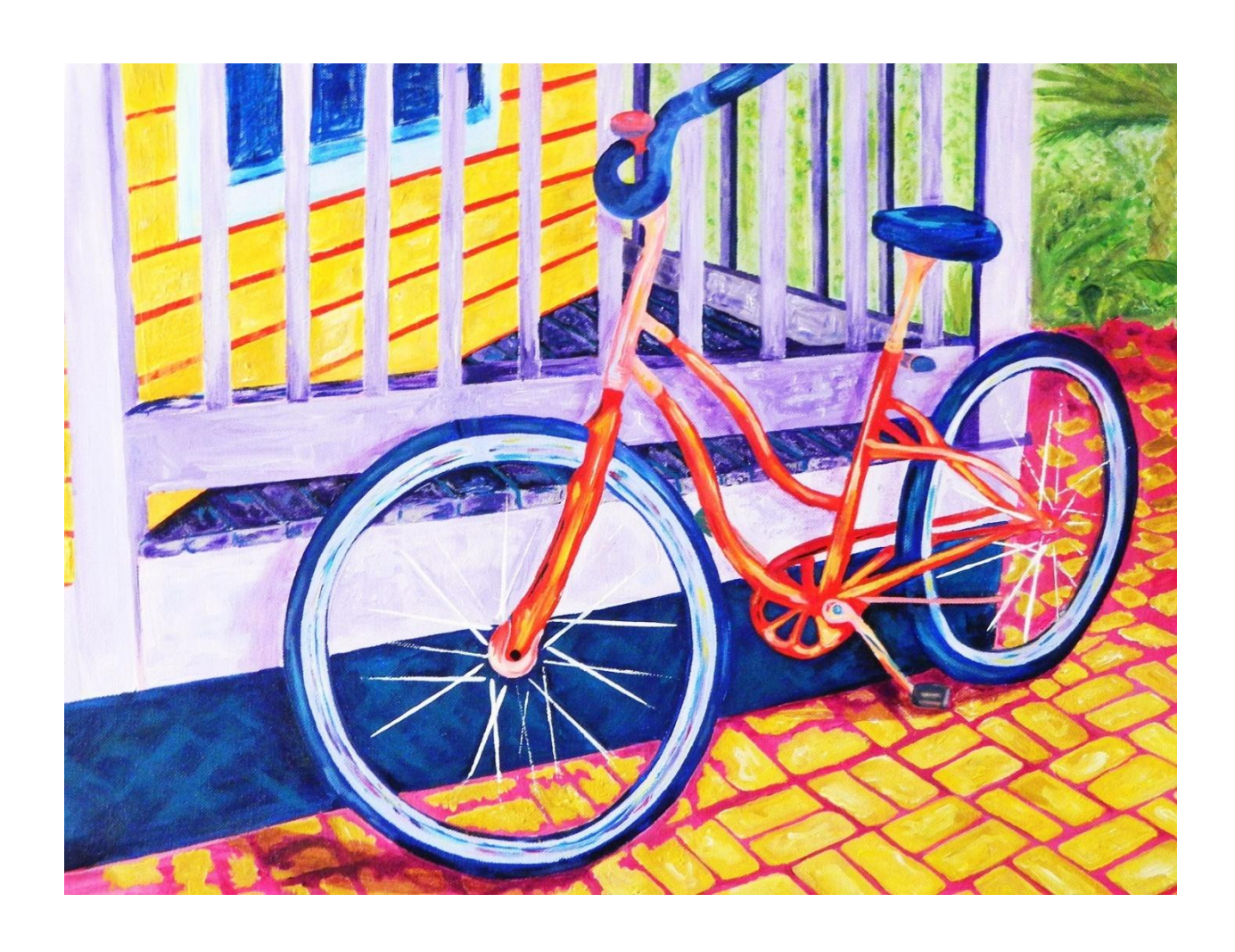
Figure 2. On the Corner, Acrylic on Canvas, 18"x 24", 2007.