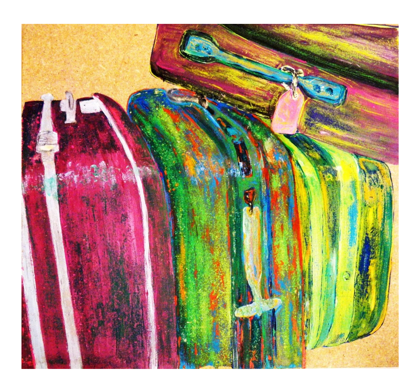
Figure 3. Carry on Baggage, Acrylic on Wood, 16"x18", 2010.