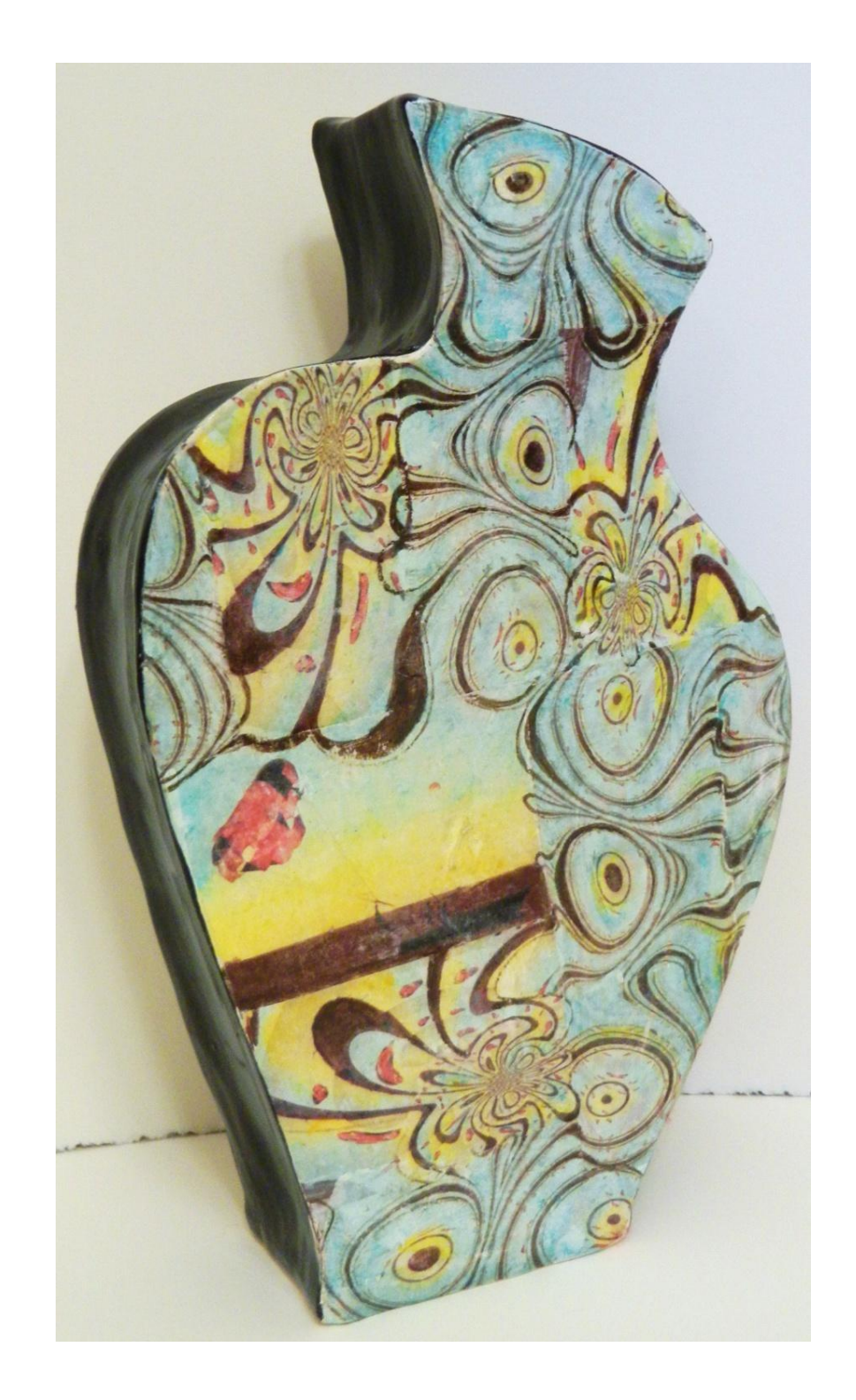
Figure 8. Sail Away, Mixed Media on Ceramic, 10"x6"x2", 2008.