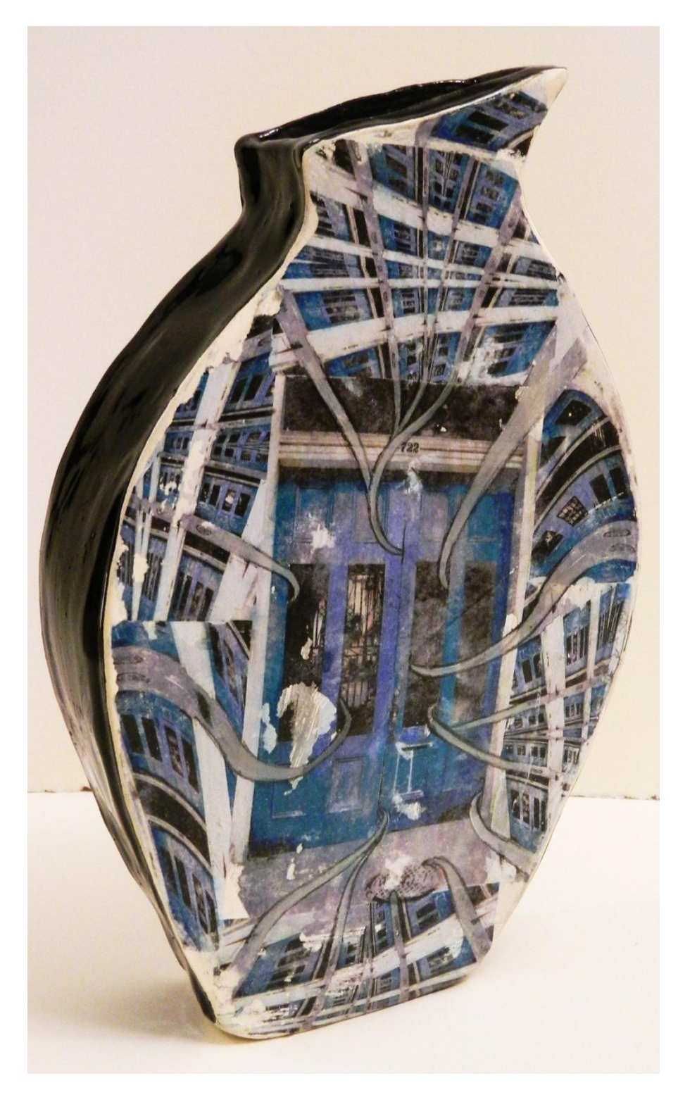
Figure 7. Bourbon Street, Mixed Media on Ceramic, 10"x6"x3", 2008.