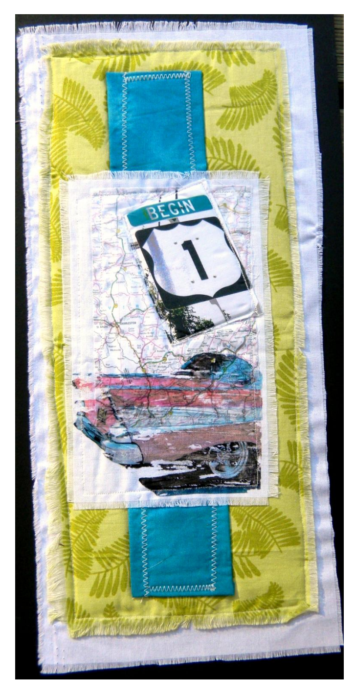
Figure 6. Rt.1 the Beginning, Mixed Media on Fabric, 18"x8", 2009.