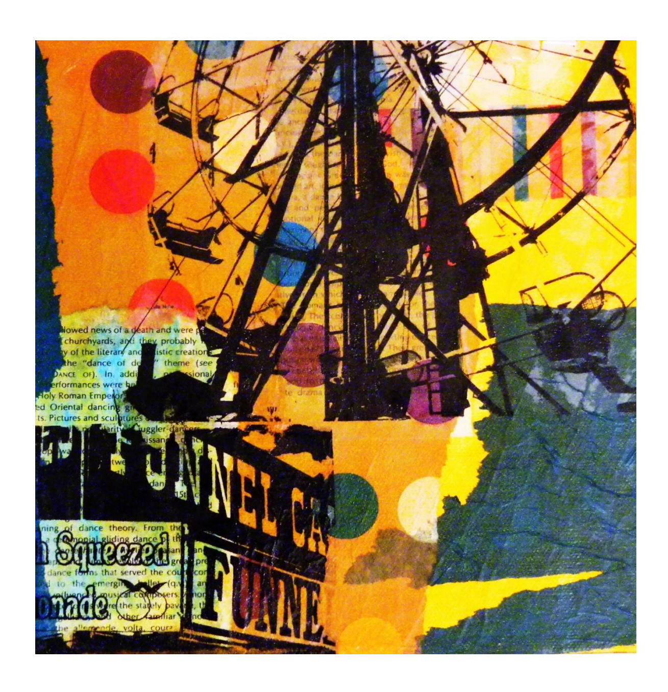
Figure 4. At the Fair, Mixed Media on Canvas, 8"x8", 2008.