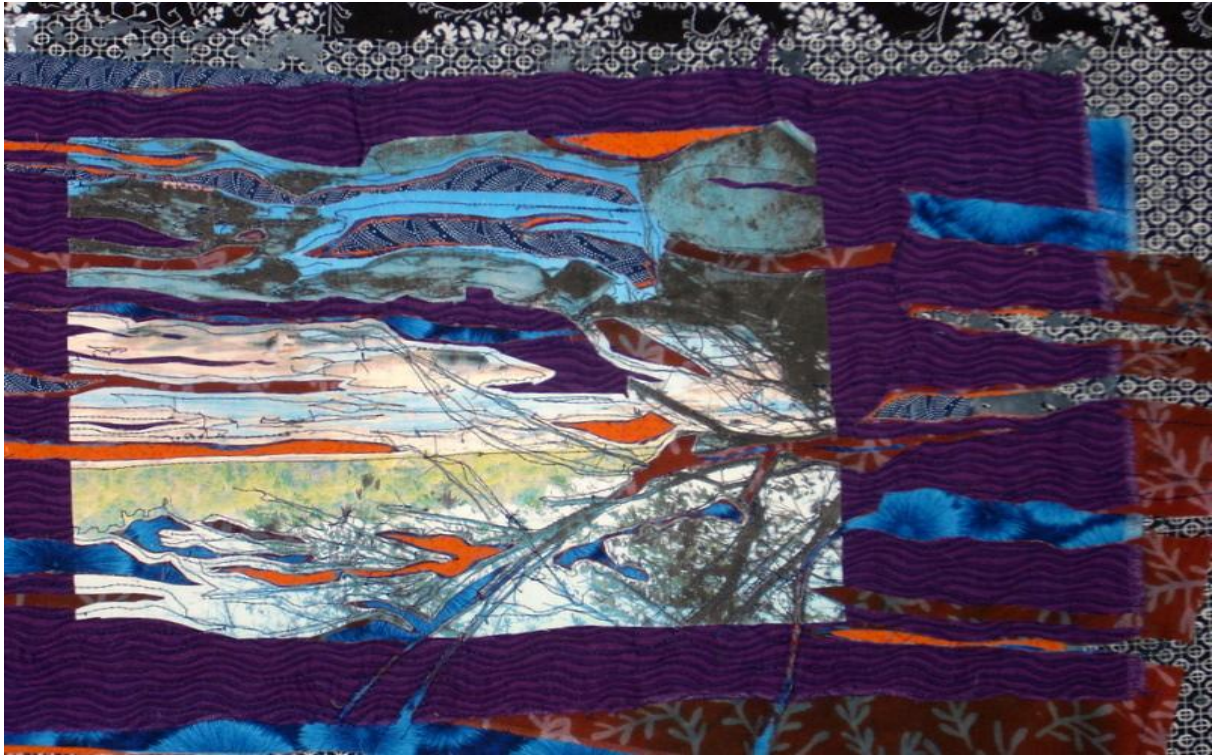
Figure 2. The Fabric Book, Page 3 (detail), fabric, pellow, stitched line, 13"x17", 2010.