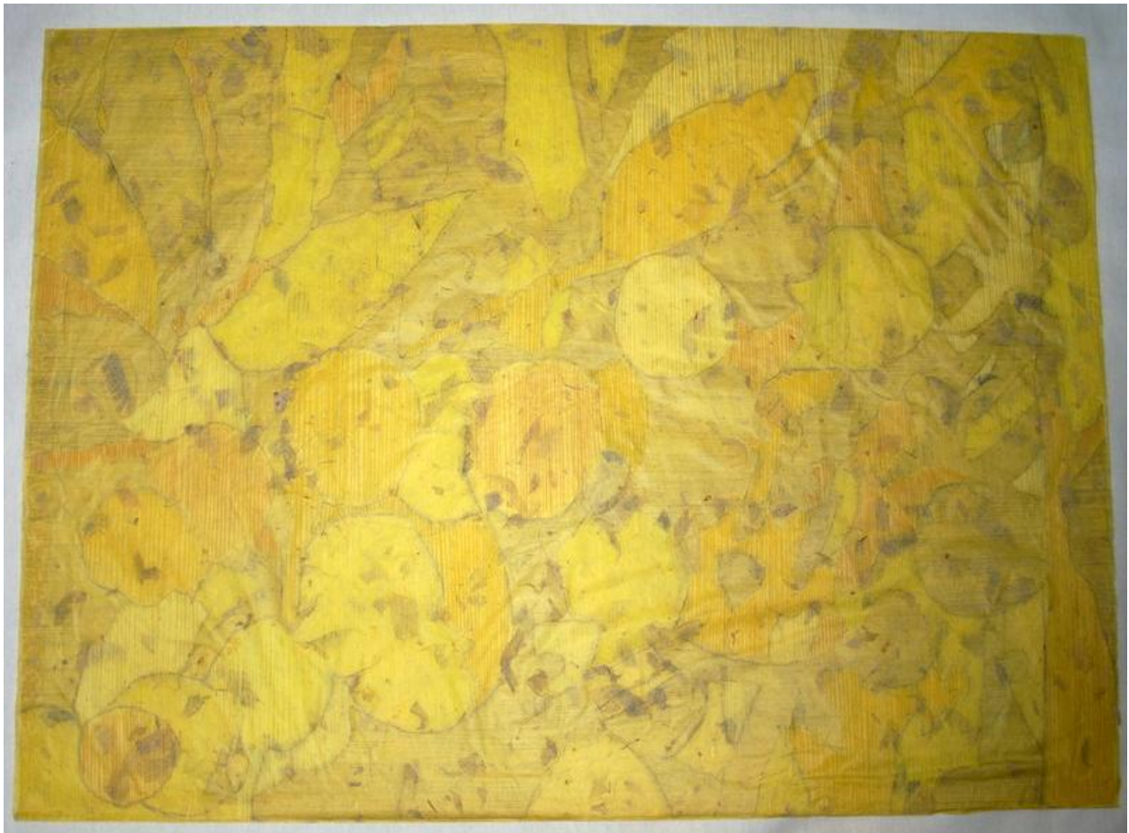
Figure 3. Drawing Series on Yellow , colored pencil, yellow paper, 22"x28", 2009.