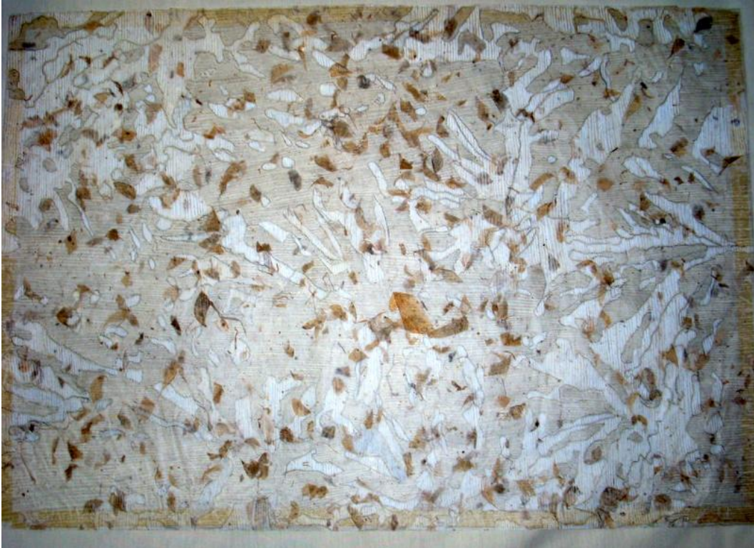
Figure 6. White Drawing , colored pencil, grease pencil, brown paper, 22"x28", 2008.