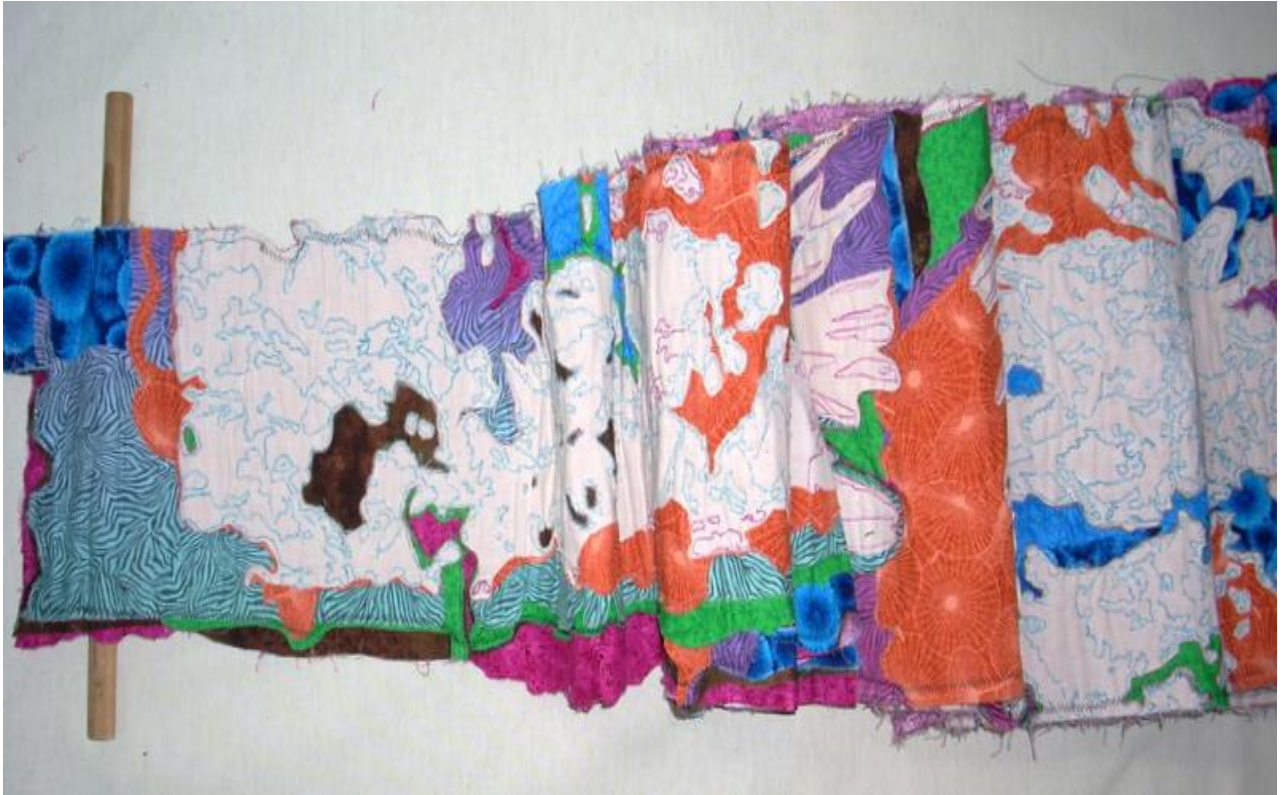
Figure 7. Rolled Scroll , (detail), fabric, indelible marker, stitched line, 14"x158" (entire piece), 2010.