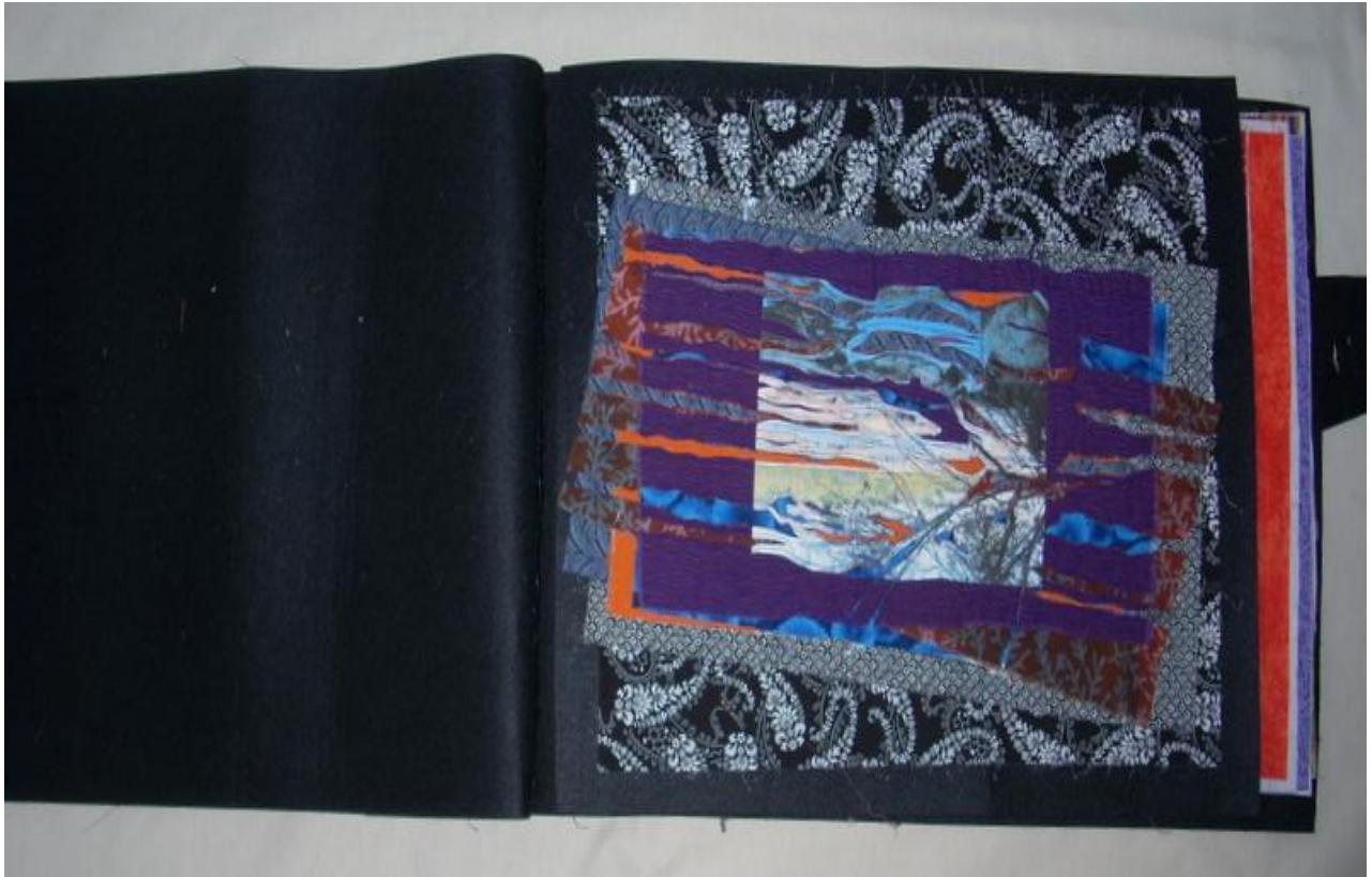
Figure 1. The Fabric Book, Page 3 (open), fabric, pellaon, stitched line, 15"x24", 2010.