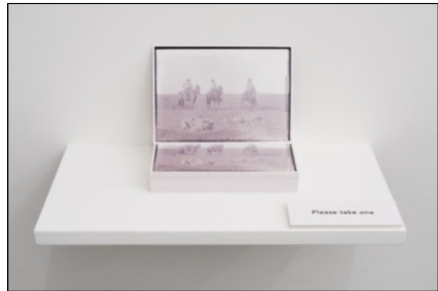
Figure 1. Reproduced postcard showing Texas Rangers posing with a person they had lynched. Making and selling postcards of lynching victims was lucrative in South Texas from 1848 until 1928.