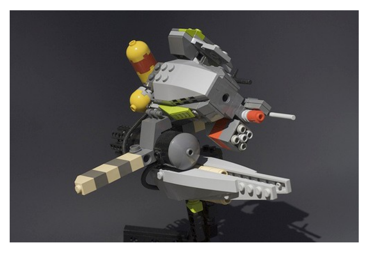
Figure 3. Forsaken by Hawk Weisman (2010). "Threw this together way back when for the Asymmetry Challenge...never quite finished it until now. Still fleshing out the Syndicate fighters — this is everything the Pariah [an earlier shared MOC] was missing."

The following is a community critique that began with Hawk's short description of his spaceship, Forsaken (Figure 3)