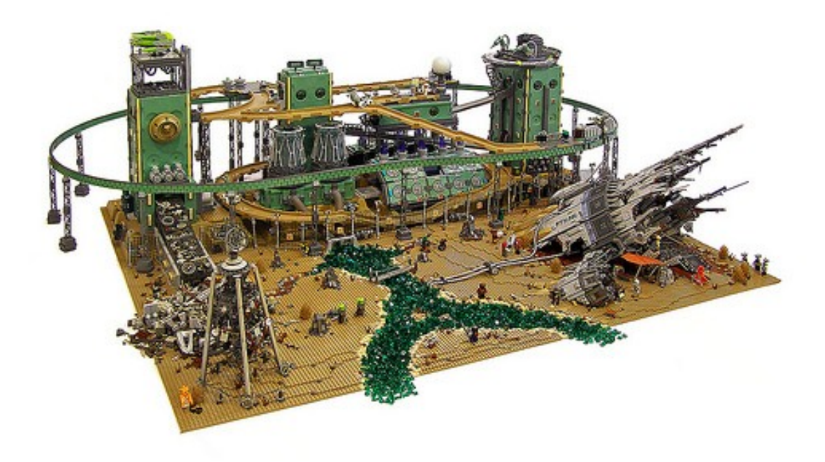
Figure 1. Containment by Nannan Zhang and Tyler Clites (2010). "Somewhere on a desolate planet, a one man operated biosphere processing facility looms over the alien wasteland. A threshold separates the two worlds, but which one is contained?"

The scene described above was from Brickworld 2010, a LEGO fan conference in its fourth year. Interest and participation in LEGO building has grown so that attendance registration for the convention has nearly doubled each year, reaching 800 in 2010. Much of the information that follows developed from conversations and interviews with builders exhibiting at the Chicago suburban conference hotel. For example, Clites and Zhang shared details on their collaboration during a lunch interview on their LEGO experience. Later in this paper we discuss the significance of their work as an exemplar of the playful constructions and interactions of the fans of LEGO.