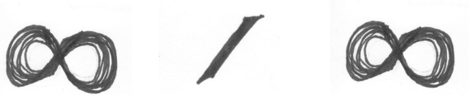
Figure 2. Formula for combining two separate blocks of representation facilitated through the hermeneutic circle of 'image' interpretation and the application of the heuretic slash.

Heuretics is the flip side of hermeneutics. While hermeneutics asks what can be made of a given text, heuretics asks what can be made from a given text; it is artistic invention. Gregory Ulmer (1994) reintroduced this concept into the contemporary dialogue. Artistic experimentation is the primary model for heuretic practice; it allows for the circulation between outside/inside, body/mind. A heuretic approach to curriculum seeks to teach the applications of interpretation and invention together noting how meaning circulates through invention. The slash in the formula functions as a means of illustrating both gap and connection. It is the stitch that holds together the interpretations as well as the signifier of a chasm of infinite possibility. The chasm provides an opening through which student and teacher, viewer and artist can produce new understandings of each other and the world (jagodzinski, 2002).