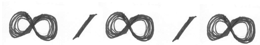
Figure 3. 'image' / 'i' / 'nation' as a formula for infinite interpretations of image, self, and the collective experience.

Heuretics is the flip side of hermeneutics. While hermeneutics asks what can be made of a given text, heuretics asks what can be made from a given text; it is artistic invention. Gregory Ulmer (1994) reintroduced this concept into the contemporary dialogue. Artistic experimentation is the primary model for heuretic practice; it allows for the circulation between outside/inside, body/mind. A heuretic approach to curriculum seeks to teach the applications of interpretation and invention together noting how meaning circulates through invention. The slash in the formula functions as a means of illustrating both gap and connection. It is the stitch that holds together the interpretations as well as the signifier of a chasm of infinite possibility. The chasm provides an opening through which student and teacher, viewer and artist can produce new understandings of each other and the world (jagodzinski, 2002).