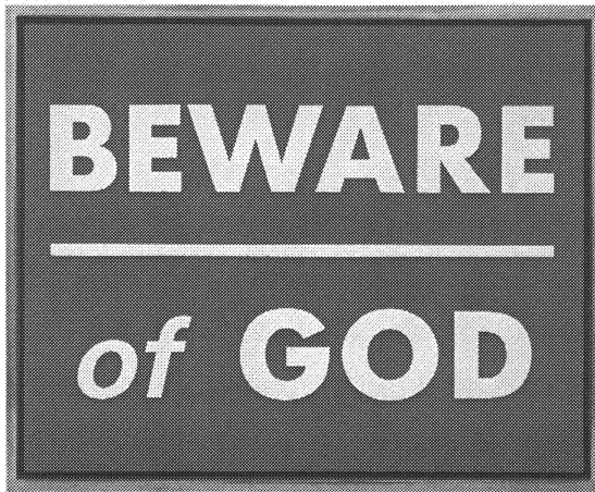
Figure 2: © Scott Greiger, Beware of God , acrylic on canvas (white text on red background) in artist's frame, 17 by 21 inches, 1996. Courtesy of the artist.

It seems to me that seeing God would have to be a complex rather than simple experience, ranging from the somber to the opposite, and consisting of more than one kind—hypothetically, all kinds—of movement. I also think that doubting simplicity is especially germane today, a period of rampant fundamentalism...Religious fundamentalists seem to be exclusively concerned with telling people what they can't do. (p. 55)