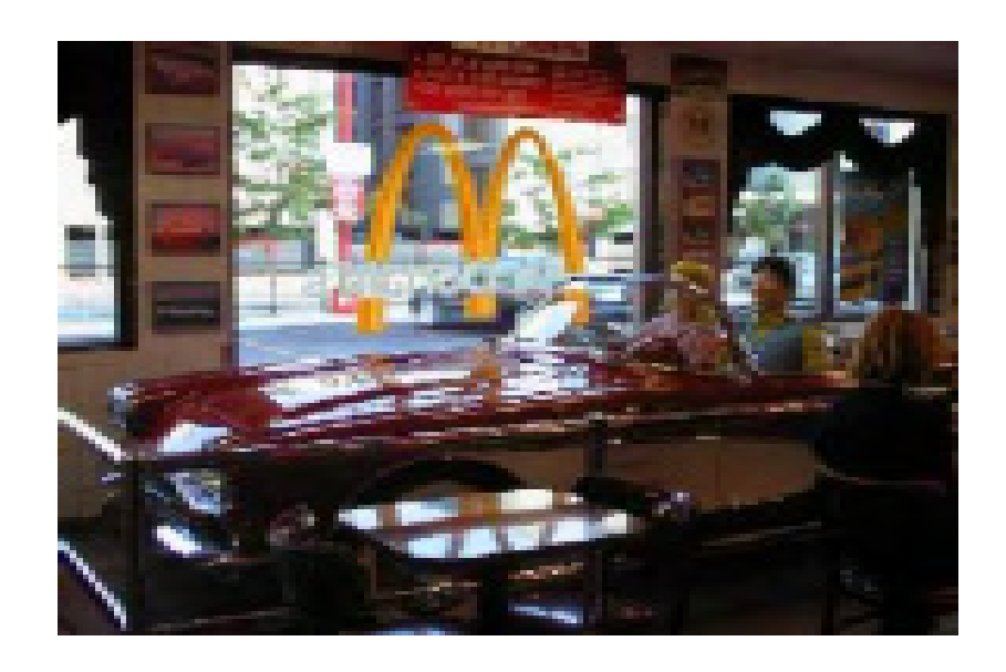
innocence?" and "What are the working conditions and labor practices of McDonald's in the United States and abroad?"

"How does McDonald's link patriotism and so-called family values to consumption?" "What do the representations in Rock and Roll McDonald's teach us about our history, gender rolls, diversity, and