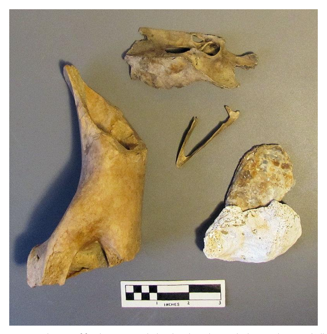
Figure 4. A selection of food remains including butchered cow, chicken, and oyster shells.

Several ca. 1790 to 1850 cut iron nails are among numerous architectural items from the well. Other architectural-related artifacts include: milled wood remains; window glass; a copper alloy door knob from a rim lock; brick rubble; mortar; plaster; slate; and one handmade coping brick (Figure 5). These items probably represent the demolition and/or construction of a structure on or near the Richmond city block of College and Marshall Streets. A barrel, represented by fragments, was probably discarded at the time of the well's abandonment as a water source.