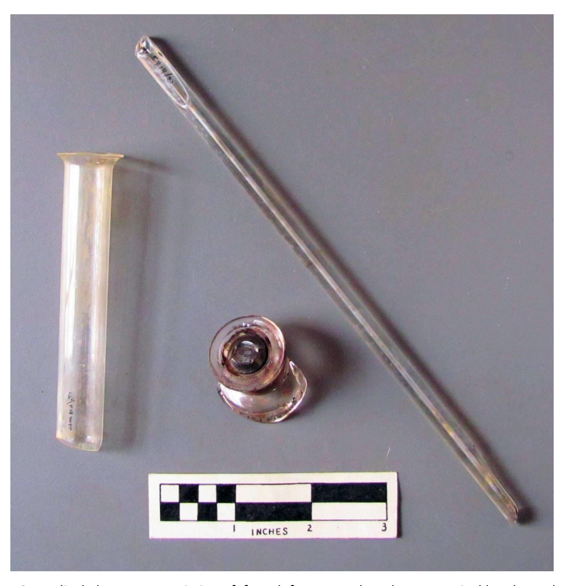
Figure 6. Medical glassware consisting of, from left, a test tube, pharmaceutical bottle, and a thermometer.

The medical assemblage includes fragments of two mouth-blown glass apothecary jars and stoppers that date from the first half of the nineteenth century. Other medical glass consists of sections of a test tube, a thermometer, and a mold-blown pharmaceutical bottle with stopper (Figure 6). Bone handles from two surgical scalpels and a fragmentary creamware ointment pot comprise additional medical equipment (Figure 7).