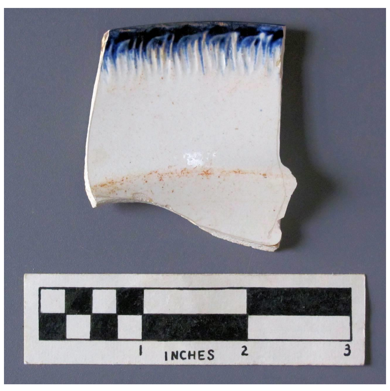
Figure 2. English whiteware platter rim with blue shell-edge, post 1840. Unscalloped shell-edge dishes such as this date to the fourth decade of the 19^{th} century.