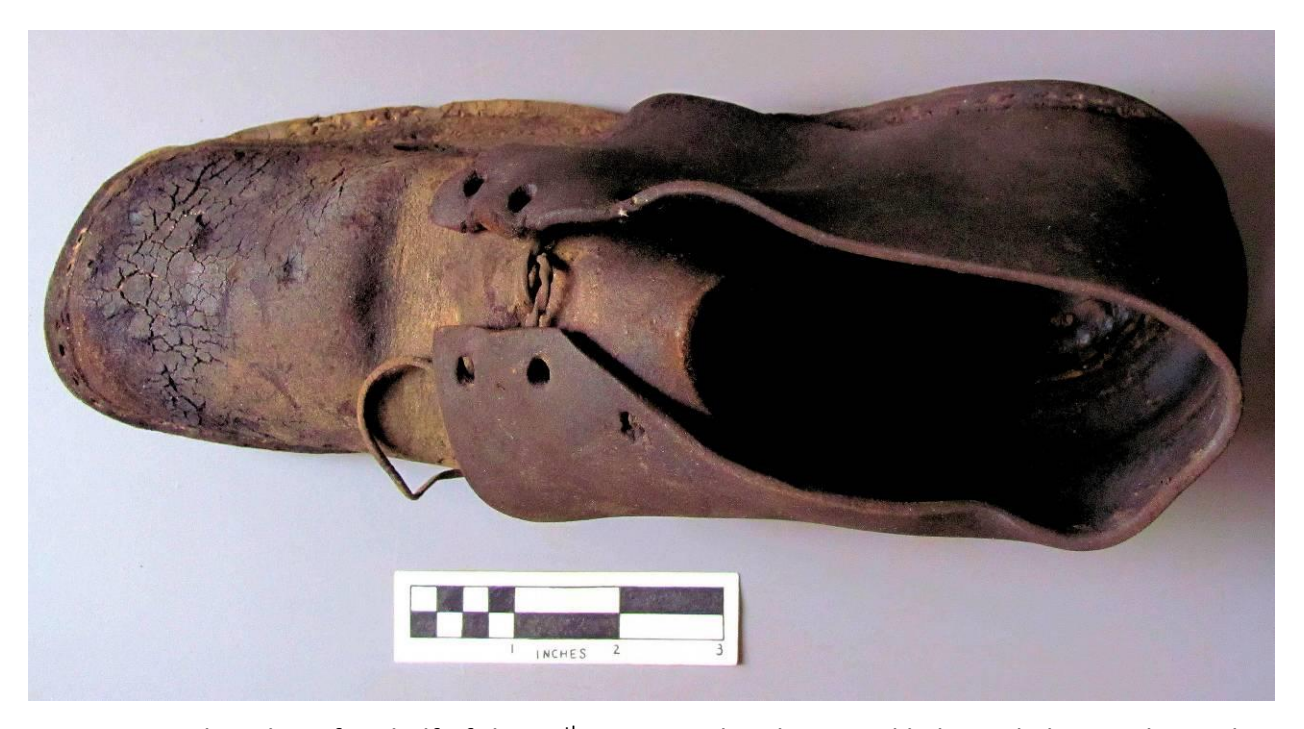
Figure 8. Leather shoe, first half of the 19<sup>th</sup> century. This shoe was likely made by a Richmond shoemaker of Bavarian descent for an enslaved African-American.

Comprised of three cross-mended pieces, another is a cheaply made man's shoe with three lace holes on both sides, and a vamp that was slit, possibly to extricate the wearer's foot (Figure 8). According to Colonial Williamsburg's Master Cordwainer D. A. Saguto, of Williamsburg, Virginia, this shoe was probably made by a Richmond shoemaker of Bavarian descent and worn by a slave.<sup>5</sup>