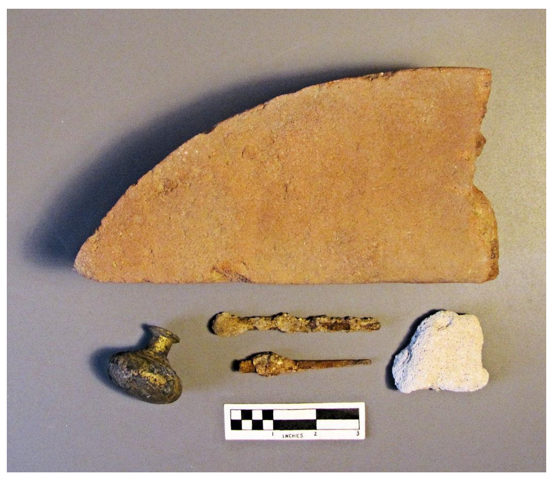
Figure 5. Selected architectural remains recovered from the well: top, coping brick; bottom, left to right, copper alloy door knob, cut iron nails, and mortar.

Near the well, on the northeast corner of College and Marshall Streets, the Egyptian Building was built to house the Medical Department of Hampden-Sydney College established in 1838.<sup>3</sup> One of the oldest medical education edifices in the South, the Egyptian Building was completed in 1845. It housed a dissecting room, lecture rooms, an infirmary, and patient beds. The well became a repository for medical waste from the medical college around this time based on dateable artifacts. This episode is marked by an abundance of human bone (Owsley and Bruwelheide, this report), as well as numerous artifacts associated with the medical profession.