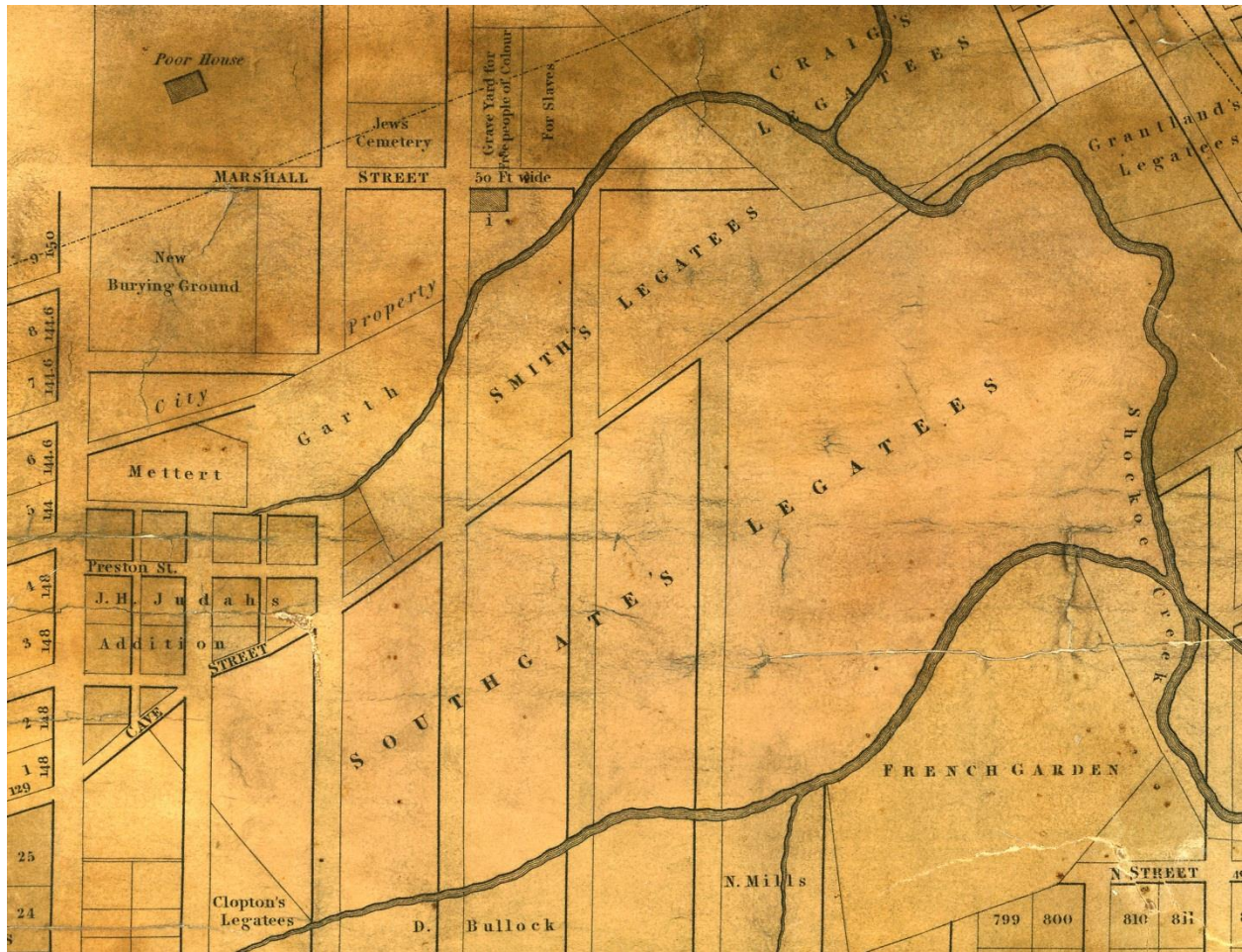
Map 1: "Plan of the City of Richmond," Micajah Bates, Richmond, VA, 1835, Library of Virginia.

Bates published this map just prior to the creation of the Medical Department of Hampden-Sidney College. It provides a detailed overview of the poor house (almshouse) and burial grounds. Bacon's Quarter Branch and Shockoe Creek is drawn further south than the actual location that these waterways cut through in the northern edge of the city.