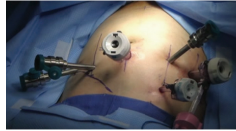
FIGURE 1: Intraoperative photograph of port placements.

2.4. Postoperative Urodynamics. Six-month postoperative urodynamic study revealed a stomal leak point pressure of less than 5 cm of H 2 O occurring after 46 mL of infused saline. A repeat urodynamic study performed two years postoperatively showed a stomal leak point pressure of less than 10 cm H 2 O after only 10 mL being infused.