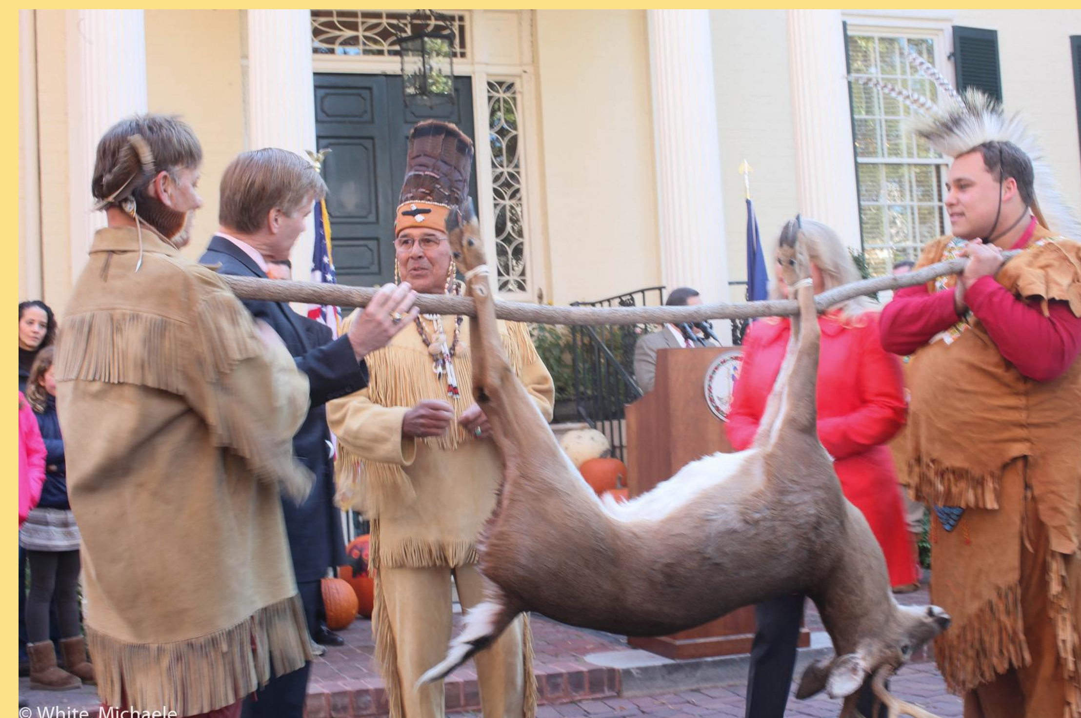
The Pamunkey and Mattaponi Tribes still pay tribute in the form of game to the Governor of Virginia each year before Thanksgiving, in keeping with the Treaty of Middle Plantation signed in 1677. The tribes pay tribute in lieu of paying state taxes. (Wood 2008)

In the 1900s when the necessity for education grew along with the competition for jobs, serious racial prejudices against minorities (including Native Americans) created a barrier to Virginia Indians reaching a high level of education and equality with other citizens.