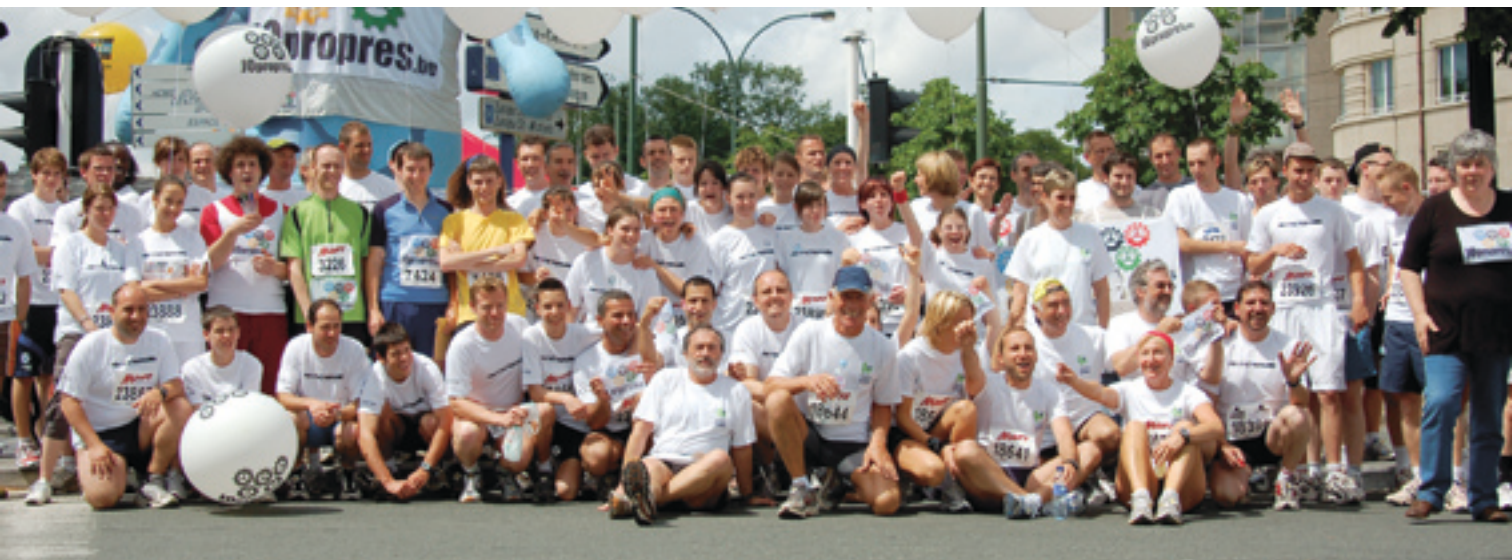
150 Play Fair activists from CCC Belgian South participate in a 20k marathon in Brussels.

tives like the Fair Labor Association (FLA) and industry bodies like the World Federation of Sporting Goods Industries (WFSGI) were in attendance as well. Some of the brands, among them Nike, adidas, New Balance, Umbro and Speedo, agreed to join a working group, with the aim of improving labour conditions by promoting union organisation, collective bargaining and social dialogue. The first meeting of the working group is scheduled for November 2008.