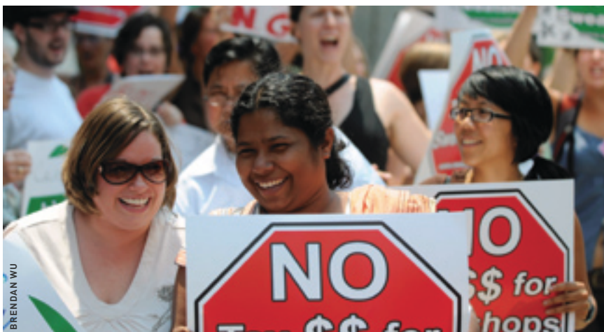
Activists from SweatFree Communities take to the streets to say 'No to Tax $$ for Sweatshops'.