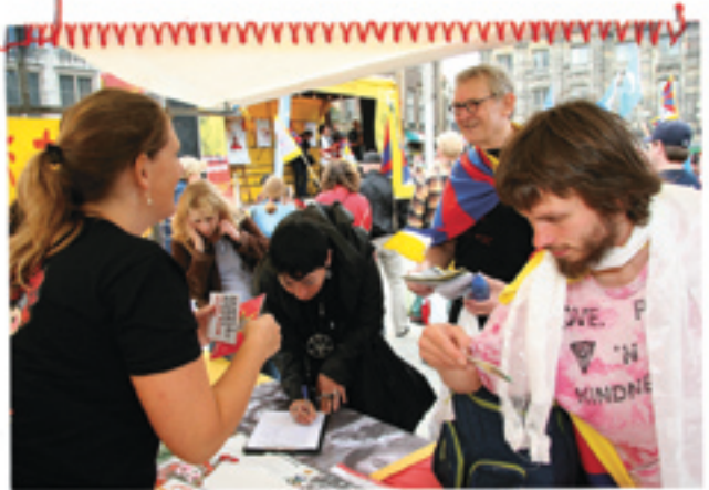
Dutch CCC at Play Fair 2008 information table.

Meanwhile, the Clean Clothes Campaign and Oxfam Australia have been reinforcing that same point in a call for sector-wide solutions in Indonesia's garment and sportswear industry.