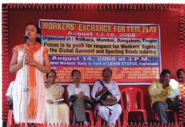
Speakers at the Play Fair 2008 Worker Organisers' Exchange in Bangalore, India.

P lay Fair 2008 calls on sportswear brands and manufacturers, the International Olympic Committee (IOC), National Olympics Committees, and national governments to take steps to eliminate the exploitation of workers in Olympic supply chains. The campaign is organised by the CCC, the International Trade Union Confederation (ITUC), and the International Textile, Garment and Leather Workers Federation (ITGLWF).