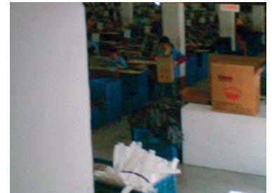
Stacks of flammable fabrics on the shop floors

In Block B, for instance, there is a cutting room on every floor. The main purpose of the cutting room is to cut the large pieces of fabric and other textiles. Workers complain about the dust and fluff from the various materials flying all over the place in these rooms. The factory does not offer the workers any protective gear. If a worker wants to wear a mask, she must buy it herself.