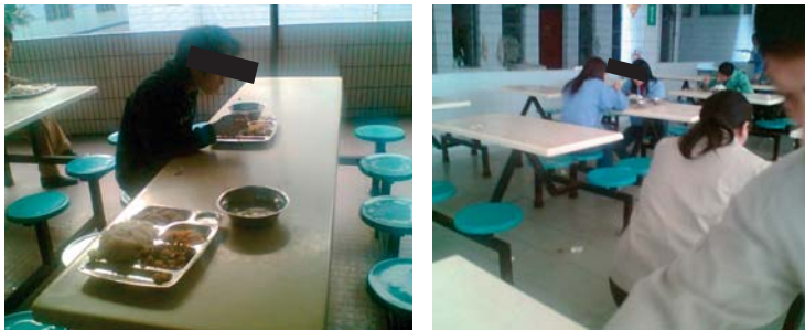
Food provided by the factory cafeteria at 120 yuan per month.

Workers find the quality of the food and accommodation at YWC satisfactory. However, they complain that the charge for food at 120 yuan a month is too high. For that fee, the factory cafeteria provides just two meals a day. Workers who choose to eat outside the factory are not charged for food, but the cost of eating outside is higher.