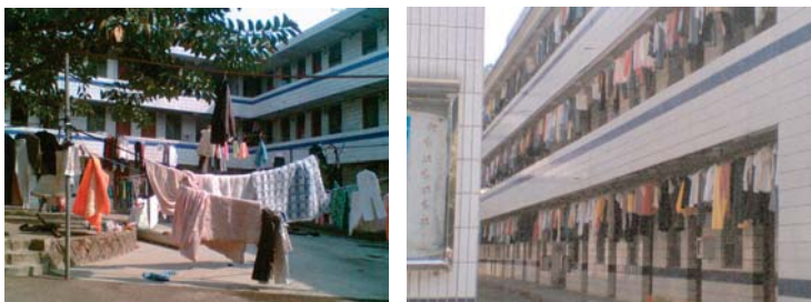
A 3-storey workers dormitory

Workers find the quality of the food and accommodation at YWC satisfactory. However, they complain that the charge for food at 120 yuan a month is too high. For that fee, the factory cafeteria provides just two meals a day. Workers who choose to eat outside the factory are not charged for food, but the cost of eating outside is higher.