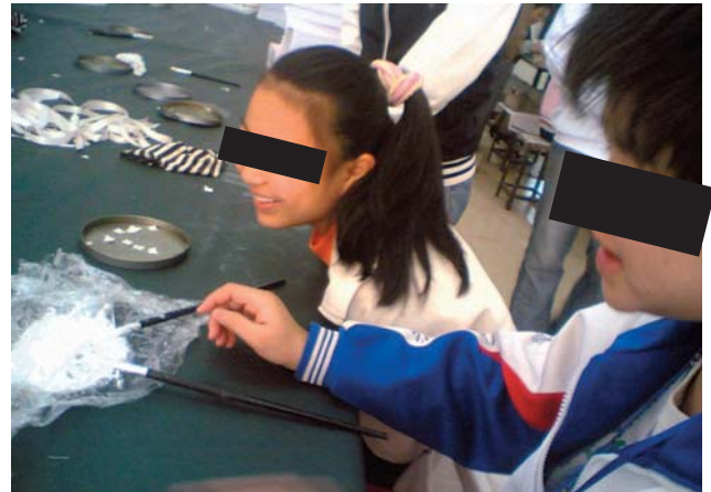
Primary and secondary school students employed at Lekit during the school holidays (A PlayFair researcher worked alongside them in January 2007).

Lekit Stationery Co., Ltd. established in 1977, is an ISO 9001 certificated manufacturer of paper and leather products. PlayFair conducted its research at one of its manufacturing facilities in Dongguan in Guangdong province.