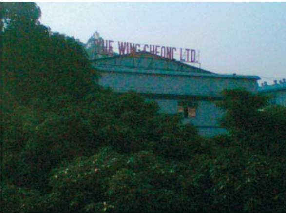
The bag manufacturing plant based in Longgang District, Shenzhen