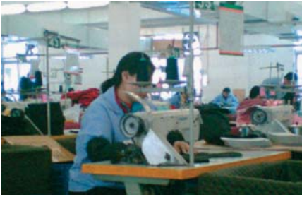
A sewing worker sits on a stool (without a back) the entire work shift

Ergonomic problems like back and leg pain are common in these workshops. Workers sit on a stool (without a back) the entire 13 hours. They use their right foot to control the machine and their hands to control the sewing process. After 13 hours of intense work, many women said that their right leg is sore and the backside is completely numb.