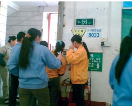
A very small number of fire extinguishers on site in the plant

In these sewing workshops, there are stacks of flammable fabrics, but there are inadequate fire extinguishers. The workers have not had any fire safety training, and if there were a fire, the results could be disastrous, PlayFair was told.