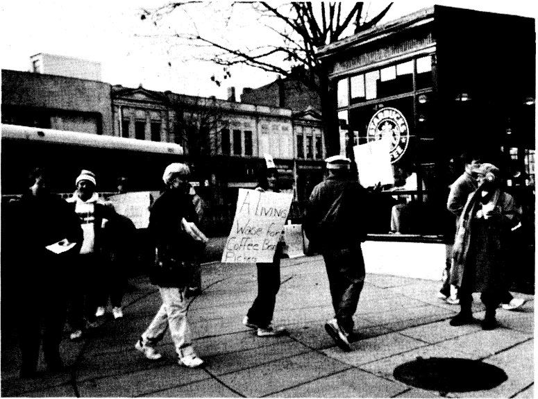
A North American campaign against Starbucks included this demonstration in front of a store in Washington, D.C.

United States. And, when a U.S.-owned garment factory in Guatemala fired its workers for organizing, the Washington, D.C.-based International Labor Rights Advocates (a project of the International Labor Rights Education and Research Fund) filed a suit in Florida against the U.S. citizen who owned the plant. The suit was settled out of court and the Guatemalan workers were reinstated.