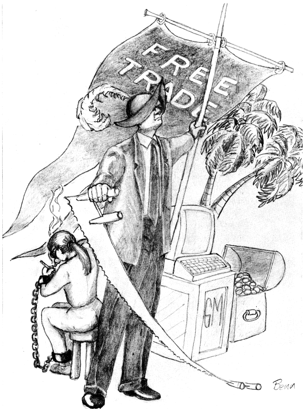
NEW TOOLS - OLD GOALS