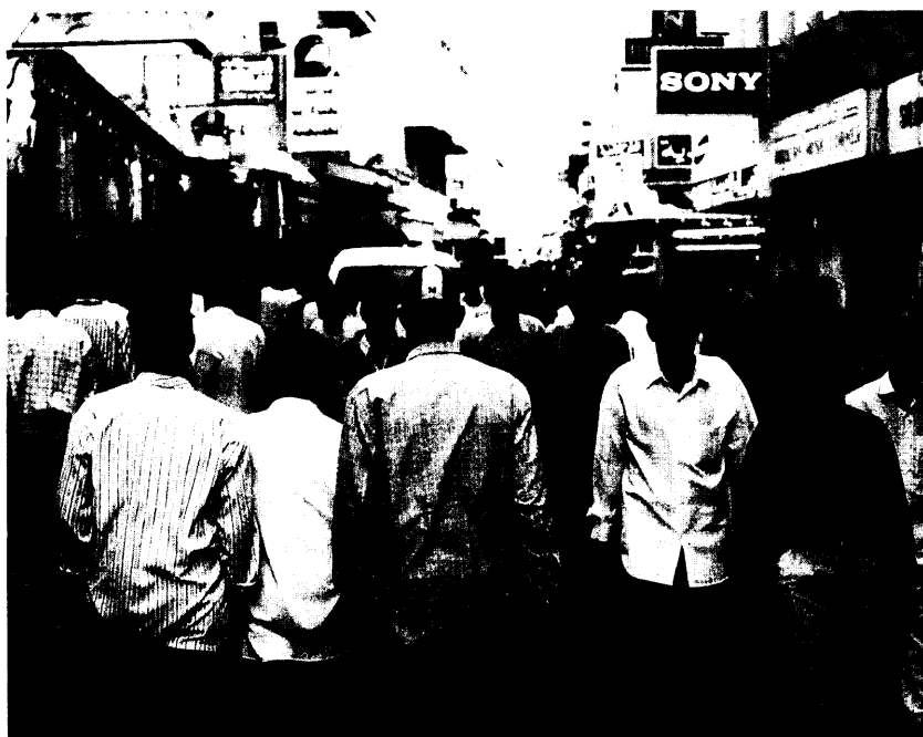
Figure 1.2. South Asian laborers fill the streets of Manama's central souk on Friday afternoons.