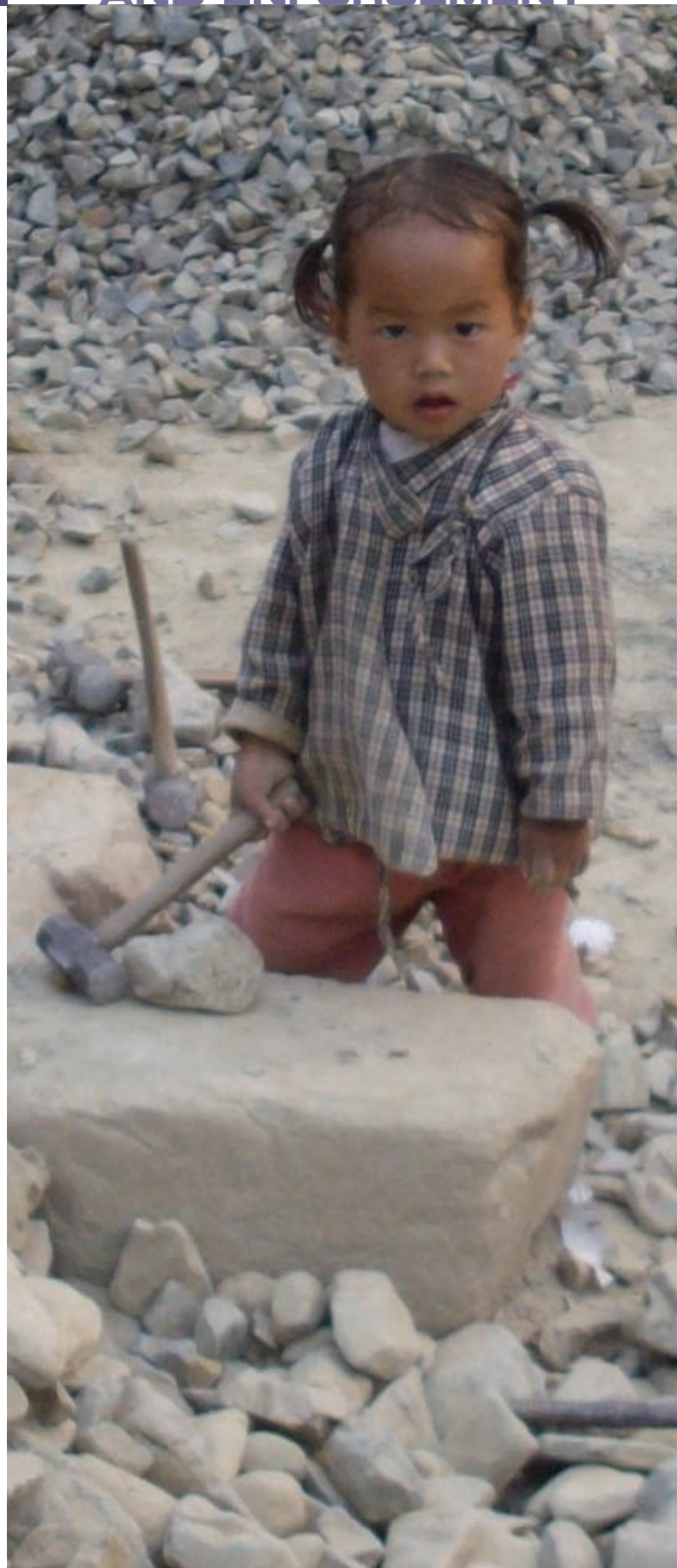
Young Nepalese girl breaks stones in a quarry

Several countries modified their minimum age and compulsory education laws during the period, which may delay the entry of children into the workforce. The African nation of Sao Tome and Principe increased the age to which education is compulsory from 13 to 15. This will likely encourage some children to postpone their entry into work, although children may legally begin working at 14 years of age. Macedonia also increased the age to which education is compulsory—from 16 to 18 years. In Nepal, the Government made education compulsory and free through the eighth grade. Argentina increased the legal minimum age for employment from 14 to 16 years, and specifically prohibited the employment of children under the age of 16 in domestic services. In Egypt, the minimum age for employment was increased from 14 to 15 years. Despite these advances, countries such as Benin, Burundi, Comoros, Equatorial Guinea, Guinea, Mozambique, Niger, Suriname, Swaziland, Trinidad and Tobago, and Uganda continue to allow children to leave school before reaching the minimum age for work, providing