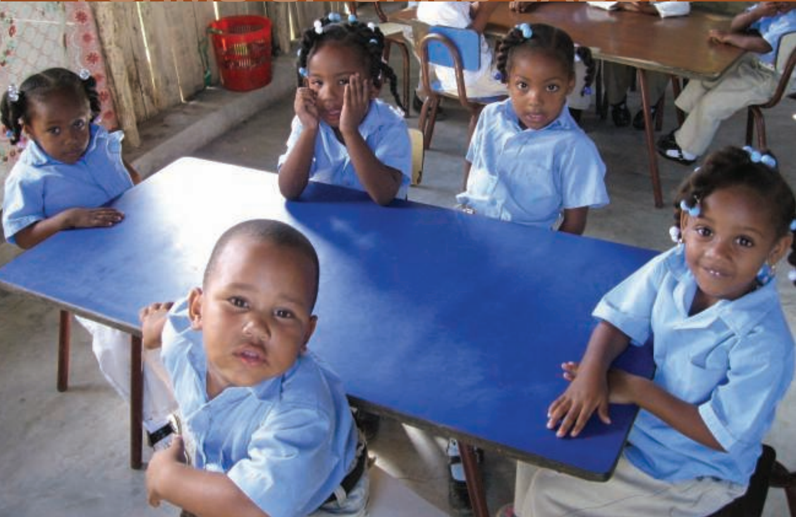
Children at risk of exploitive labor in the Dominican Republic attend a USDOL-funded afterschool enrichment program.