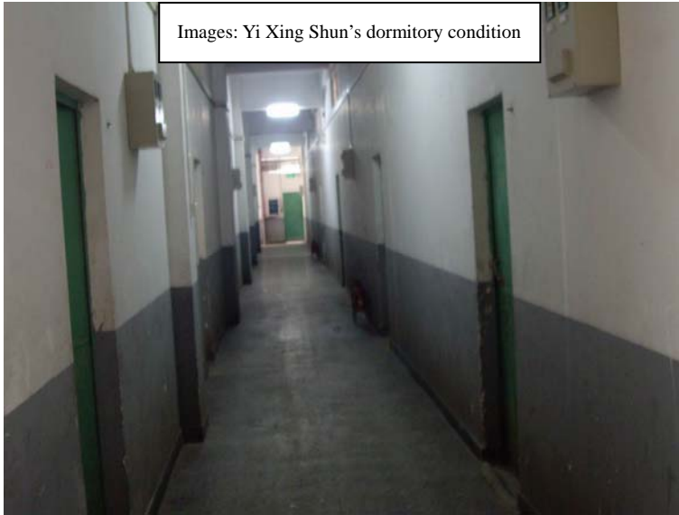
Images: Yi Xing Shun's dormitory condition

according to room size, 40, 60 or 80 RMB.