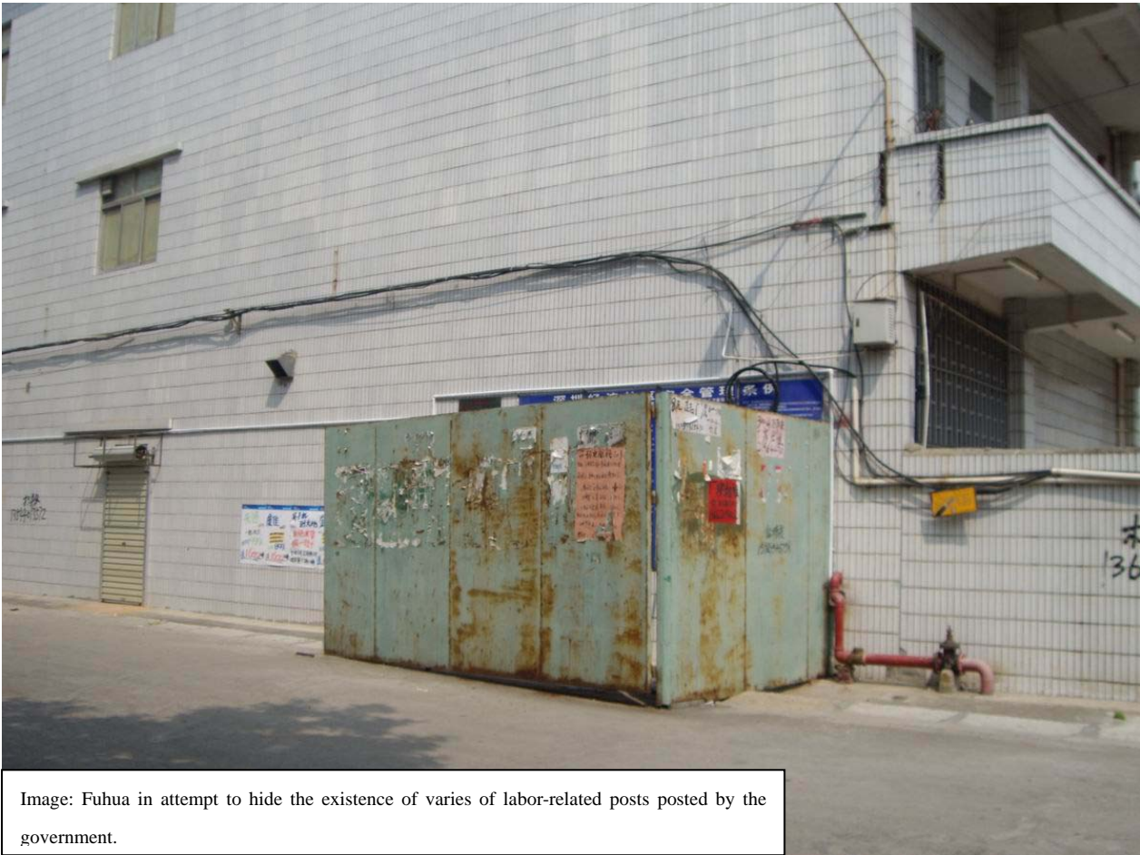
Image: Fuhua in attempt to hide the existence of varies of labor-related posts posted by the government.