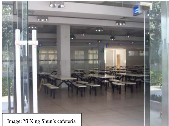
Image: Yi Xing Shun's cafeteria

Yi Xing Shun provides food and housing in a dormitory. An eight RMB daily meal fee will be deducted from workers who dine at the cafeteria. In the past, due to bad food quality, many workers chose to dine outside the factory without subsidy given by the factory. Since October 2007, due to unknown reason, the cafeteria's food has improved dramatically.