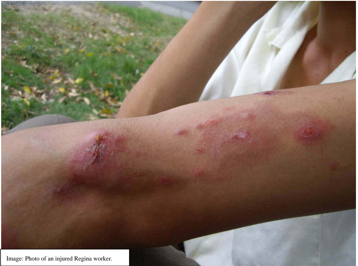
Image: Photo of an injured Regina worker.