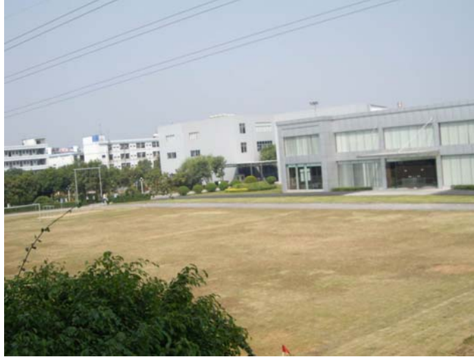
Images: Factory's exterior

Workers do not need to pay a deposit upon recruitment. Yi Xing Shun provides two copies of the contract for workers to sign, and workers are able to receive a copy.