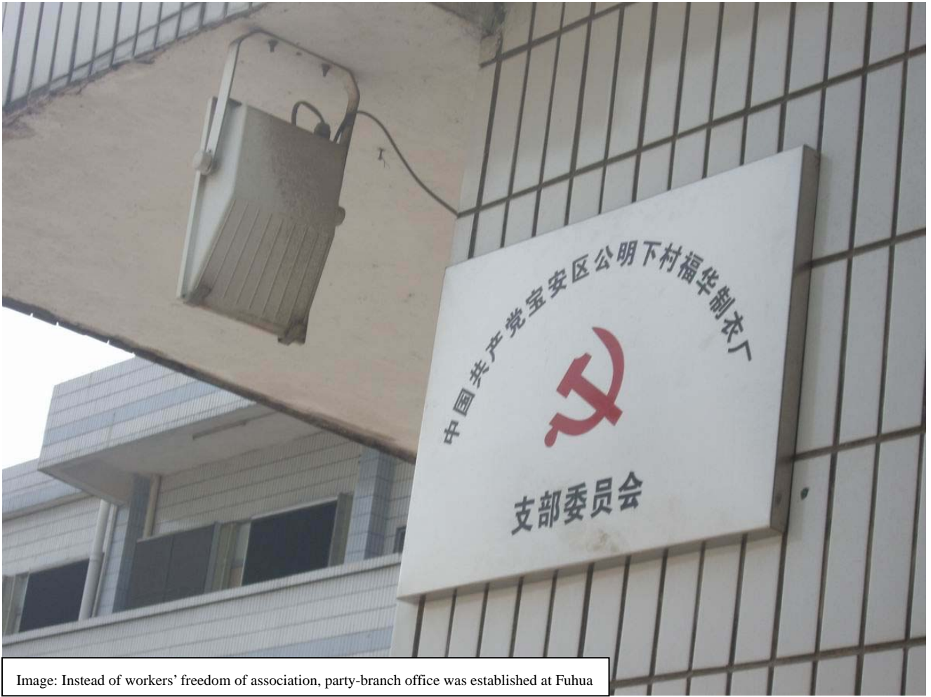
Image: Instead of workers' freedom of association, party-branch office was established at Fuhua