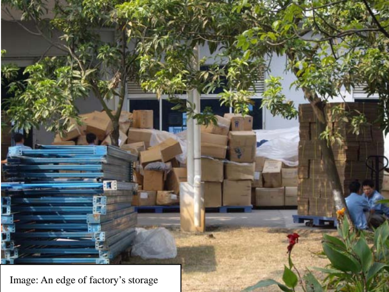
Image: An edge of factory's storage

Workshops are installed with a ventilation system and an air conditioner. Workers are also provided with safety equipment. Chemicals are rarely involved during production. Since October 2007, the environment in the workshops has improved dramatically, and regular check ups take place daily.