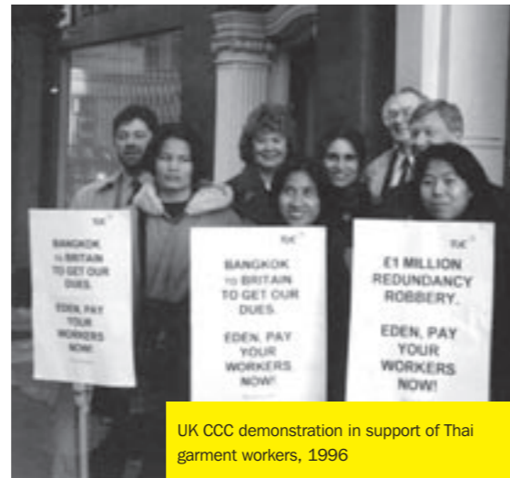
UK CCC demonstration in support of Thai garment workers, 1996

The CCC has limited resources and unfortunately is not able to follow-up on all the requests for action that are received. Decisions to take up cases are made by the CCC International Secretariat in conjunction with the urgent appeal coordinators at the various national-level CCCs (each CCC is a coalition of NGOs and trade unions, and each has a designated urgent appeal coordinator). These decisions are generally based on capacity available at that moment to undertake effective action. In prioritizing cases, national-level CCCs usually prefer to get involved in cases that have a connection to their coalition or market (ex. the German campaign is more likely to work on a case that involves a company that has its headquarters in Germany, or if based elsewhere sells its products in Germany). If the CCC is unable to take up a case, the campaign will, if possible, refer requests for assistance to other organizations that might be able to provide such support.