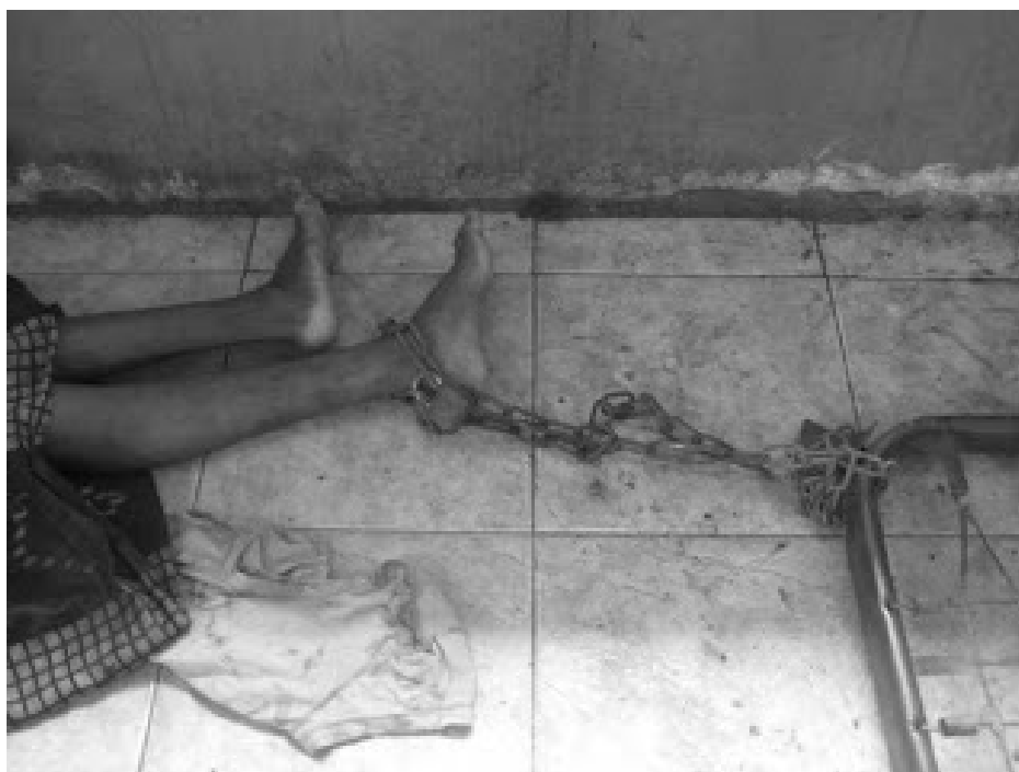
Figure 1. Chained Mental Health Patient (Hill & Jaffa 2008)