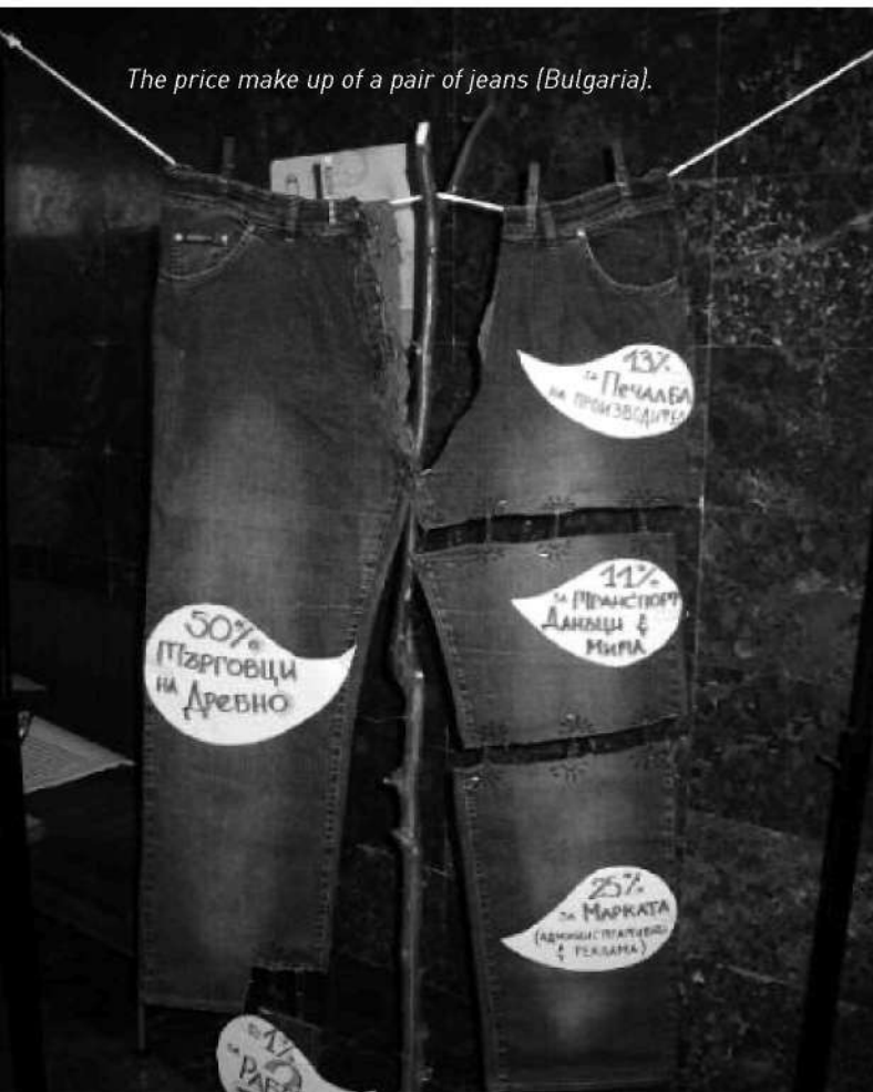
The price make up of a pair of jeans (Bulgaria).

For more on the garment industry in Bulgaria, Macedonia and Serbia, as well as Turkey, Poland, Romania and Moldova, please see "Workers' Voices – The Situation of Women in the Eastern European and Turkish Garment Industries" (details page 23). The exhibitions were based upon the research done for this report.