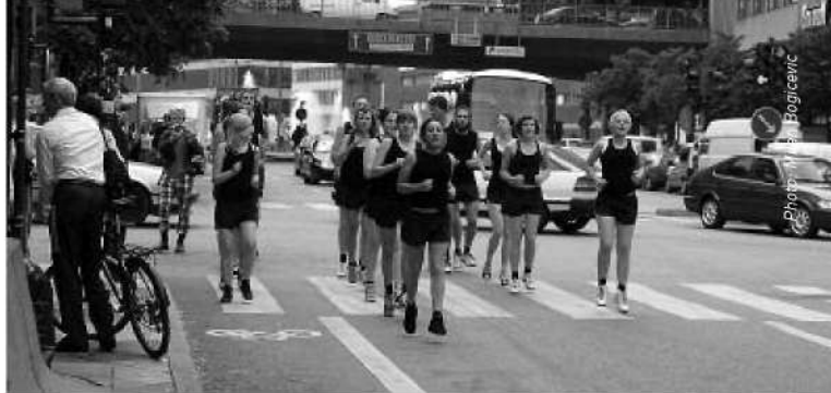
CCC Sweden "army" action, during the Olympic torch relay race, Stockholm July 2004.