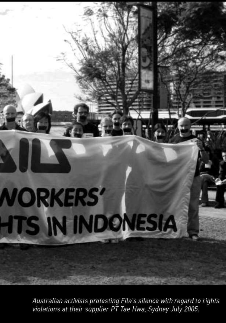
Australian activists protesting Fila's silence with regard to rights violations at their supplier PT Tae Hwa, Sydney July 2005.