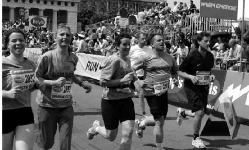
CCK supporters sweating for justice at the Vienna 2005 Marathon.