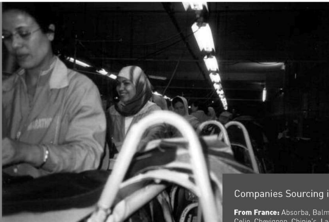
Workers in a jeans factory in Tunisia.