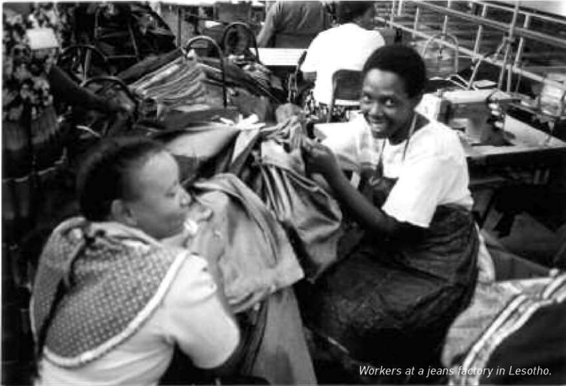
Workers at a jeans factory in Lesotho.