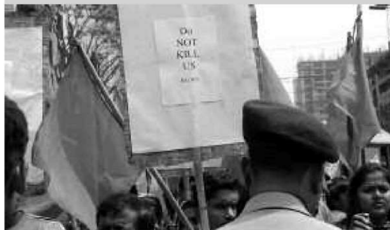
Sign held by protestor at March 22, 2006 demonstration organised by the National Garment Workers Federation, Bangladesh, demanding follow-up on health and safety problems in garment factories.

For more details on these cases see www.cleanclothes.org/urgent/06-03-03.htm