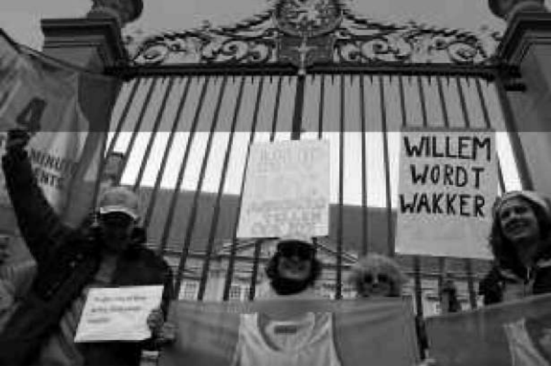
Dutch CCC activists gather in front of the Royal Palace in The Hague to send a message to Prince Willem-Alexander who is a member of the International Olympic Committee, February 2006. Their poster "Willem Wordt Wakker" means "William Wake Up," also the title of a popular song from the sixties.