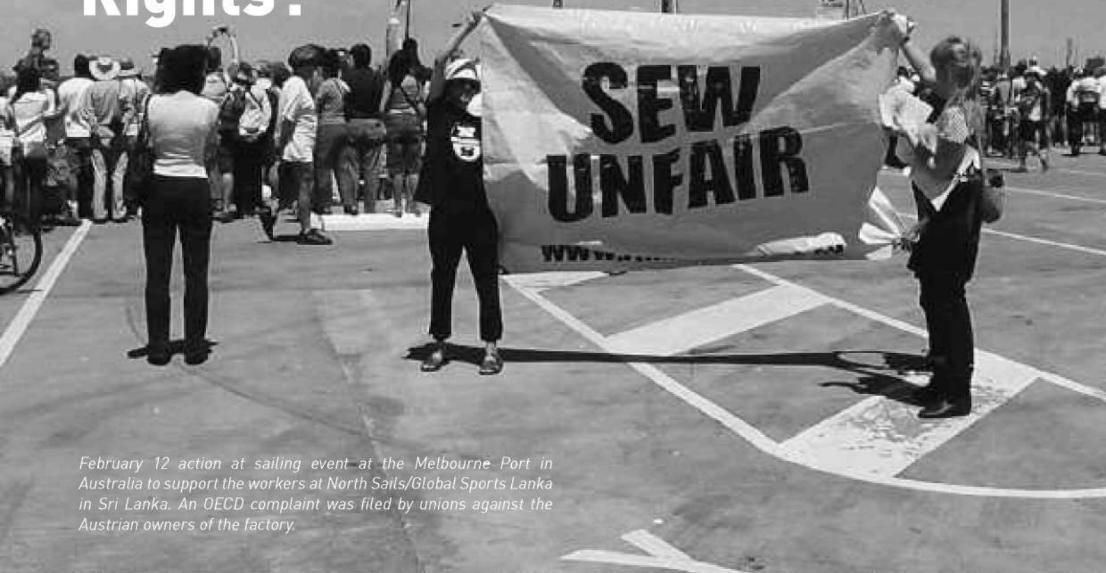
February 12 action at sailing event at the Melbourne Port in Australia to support the workers at North Sails/Global Sports Lanka in Sri Lanka. An OECD complaint was filed by unions against the Austrian owners of the factory.

Among the few international instruments agreed by governments about how corporations should behave are the “OECD Guidelines for Multinational Enterprises”. The OECD, or Organisation for Economic Co-operation and Development, is made up of thirty states from the industrialised countries plus some from the Central-Eastern European region. It has advisory committees from the international trade union movement (the Trade Union Advisory Committee, TUAC) as well as business (the Business and Industry Advisory Committee, BIAC).