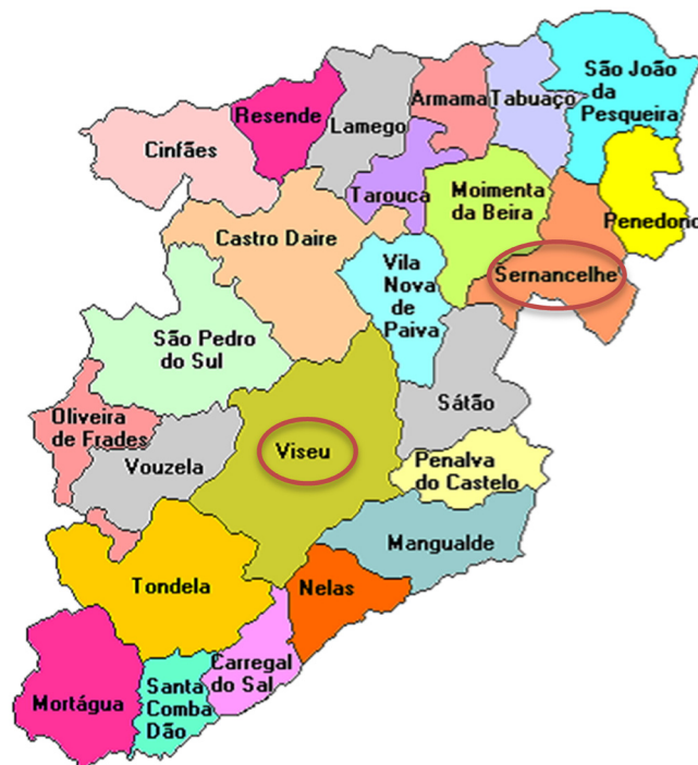
Figure 1: Geographic origins of the samples used in the study.

The colour was assessed by the Cartesian coordinates CIE L^* , a^* , and b^* using a colorimeter Konica Minolta CR-400. The L^* coordinate represents the lightness, varying from 0 (black) to 100 (white). The a^* and b^* represent chromaticity coordinates ranging from -60 to +60 . The