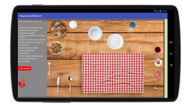
Fig. 3: The app interface for cooperating with the robot by the tablet

The virtual environment for setting a table was implemented by an Android app, designed and built by the Mit App Inventor platform by the Massachusetts Institute of