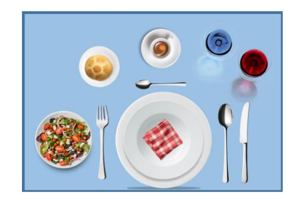
Fig 1. The etiquette schema defining the rules for setting up the table

The scenario consisted to virtually set up a table with the robot, following an etiquette schema . The schema defines the set of rules according to which the utensils have to be arranged in the table. Fig. 1 shows the etiquette schema used in the experiments. If an utensil is finally placed on a different position than the expected one according to the schema, the etiquette rule for that utensil is infringed.