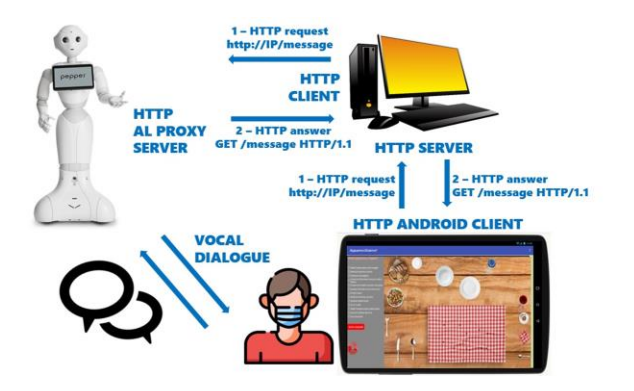
Fig.4: The platform for making communication between the app and the robot

• the server , when it receives request by the app, that will be in turn switched to the robot's proxy.