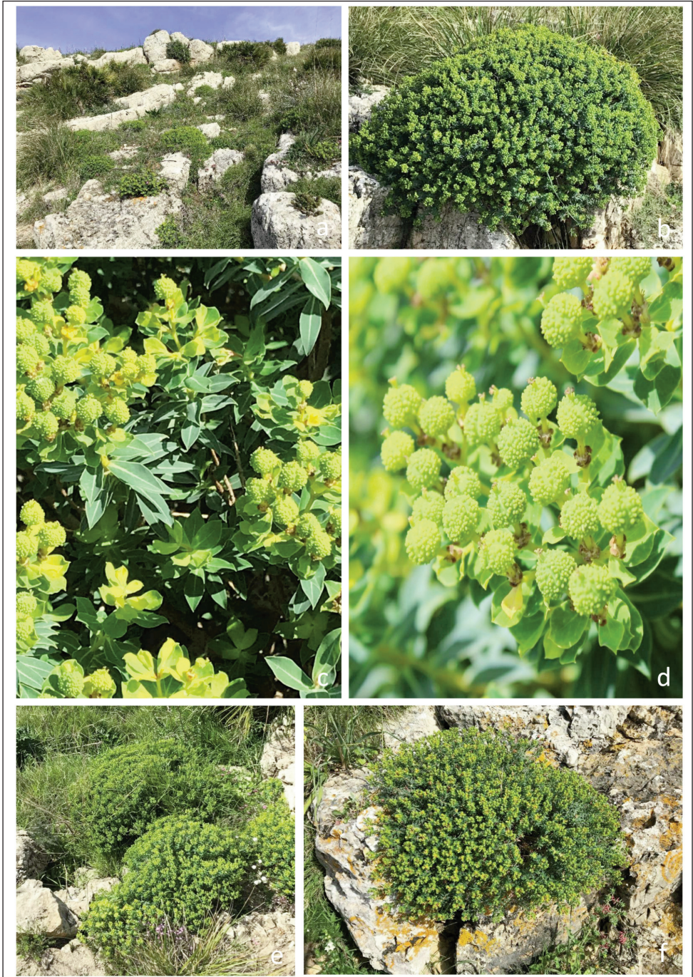
Fig. 1a-f. Pulvinate habit of Euphorbia papillaris and its habitat in the Sicilian new site of Mt Erice (Erice, Trapani).