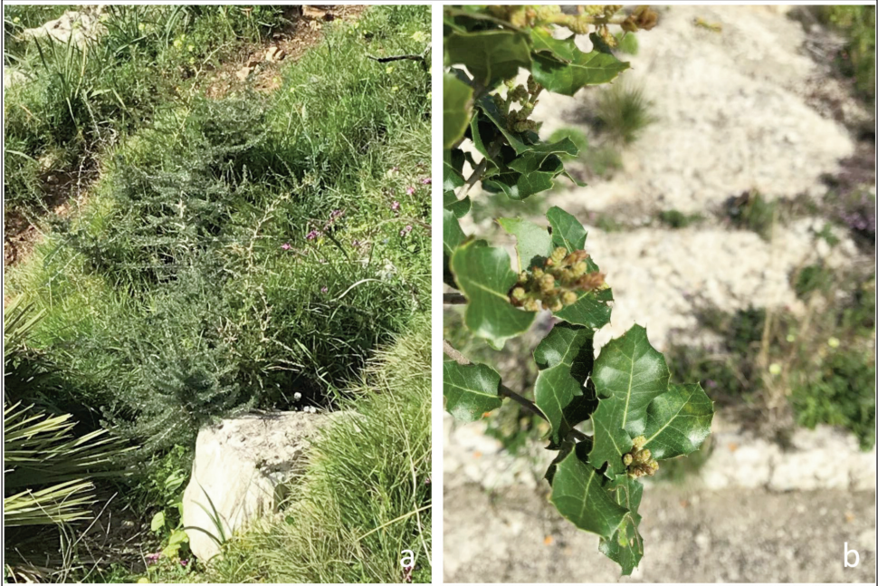
Fig. 2. Asparagus pastorianus (a) and the rare Quercus calliprinos (b) in the new site of Euphorbia papillaris on the limestone slopes of Mt Erice (Trapani).