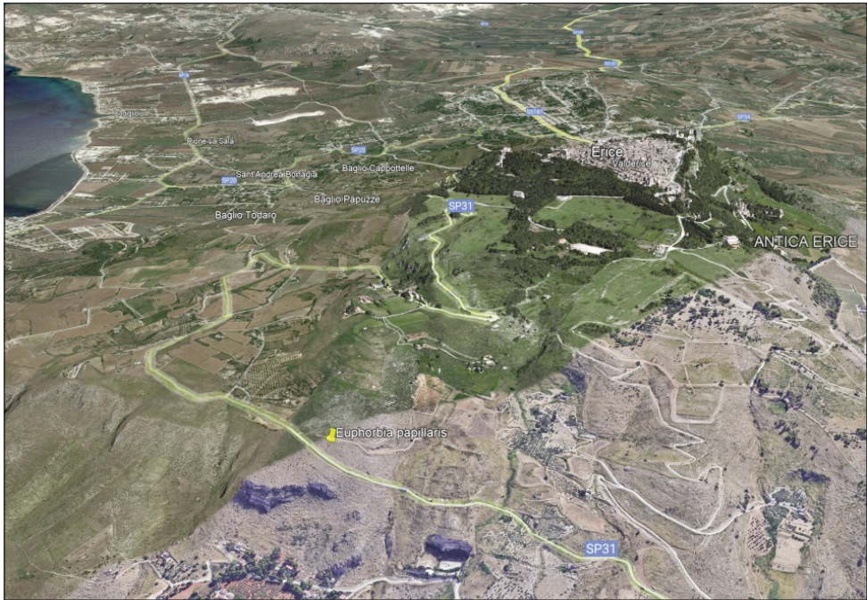
Fig. 3. The area of Mt Erice (N-W Sicily) with the localization of the new site of Euphorbia papillaris (prepared by Google Earth Pro).