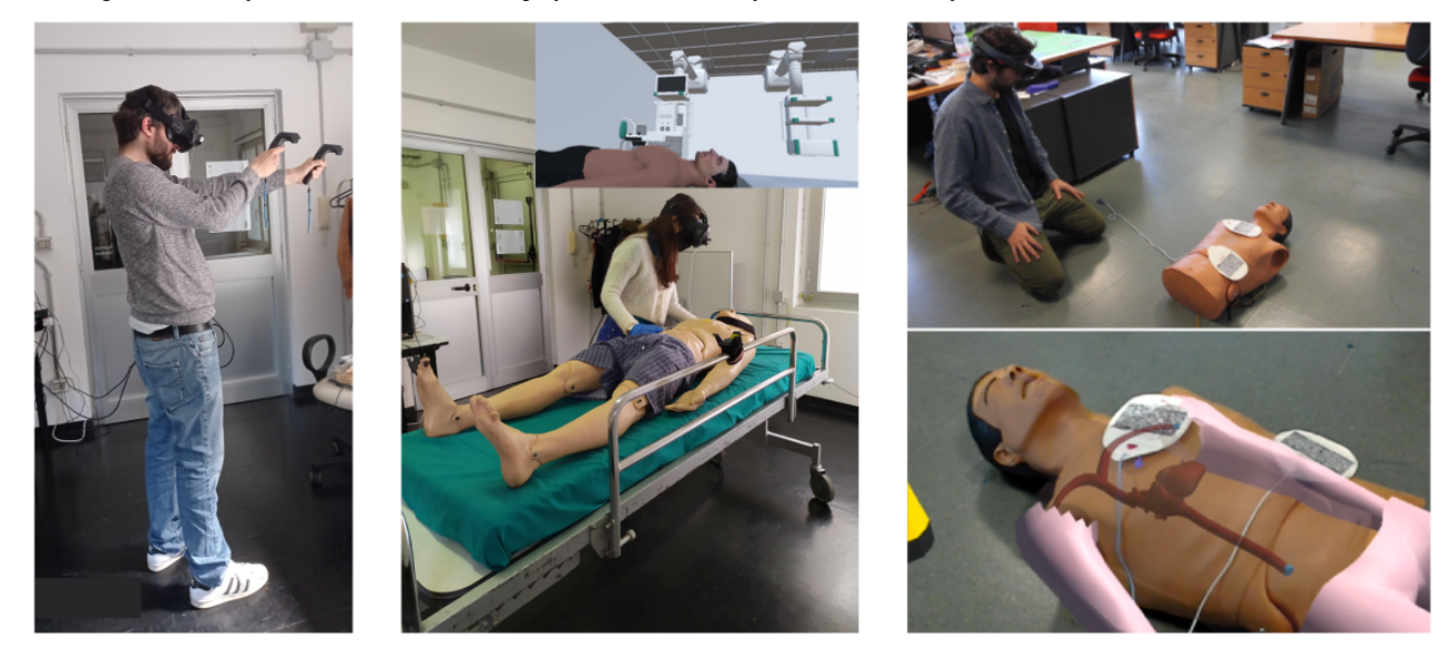
Figure 2. Examples of immersive tools. Left: VR application without haptic feedback. Center: MR system which combines an HMD with a manikin for a more realistic simulation experience. Right: AR application (Holo BLSD) designed to augment a physical manikin with a virtual representation [75]. AR: augmented reality; HMD: head-mounted display; MR: mixed reality; VR: virtual reality.

The first example of an MR tool for CPR training is the virtual reality enhanced mannequin (VREM), which combines a half-body manikin with HMD, data gloves, and tracking devices [57]. During the simulation, the user is immersed in a VR environment, but at the same time, they can physically interact with the manikin, as his/her hands' movements are tracked in real time [57]. Despite having some limitations, such as the lack of performance evaluation, VREM was the first example of MR that combined immersive VR with manikins traditionally used to teach lifesaving skills. VREM was the sole example of an MR simulator until 2018 when new developments and tools