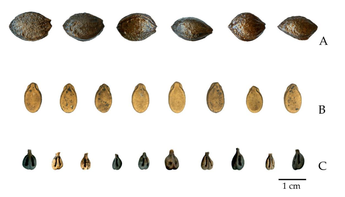
Figure 3. Representative image of some of the archaeological samples used in this work: ( A ) Prunus domestica; ( B ) Citrullus lanatus var. lanatus; ( C ) Vitis vinifera subsp. vinifera .

The archaeological samples were previously cleaned and identified at the species level at the Laboratorio di Palinologia e Paleobotanica of the University of Modena and Reggio Emilia and then delivered to Cagliari University for subsequent morphometric analysis to determine the cultivars.