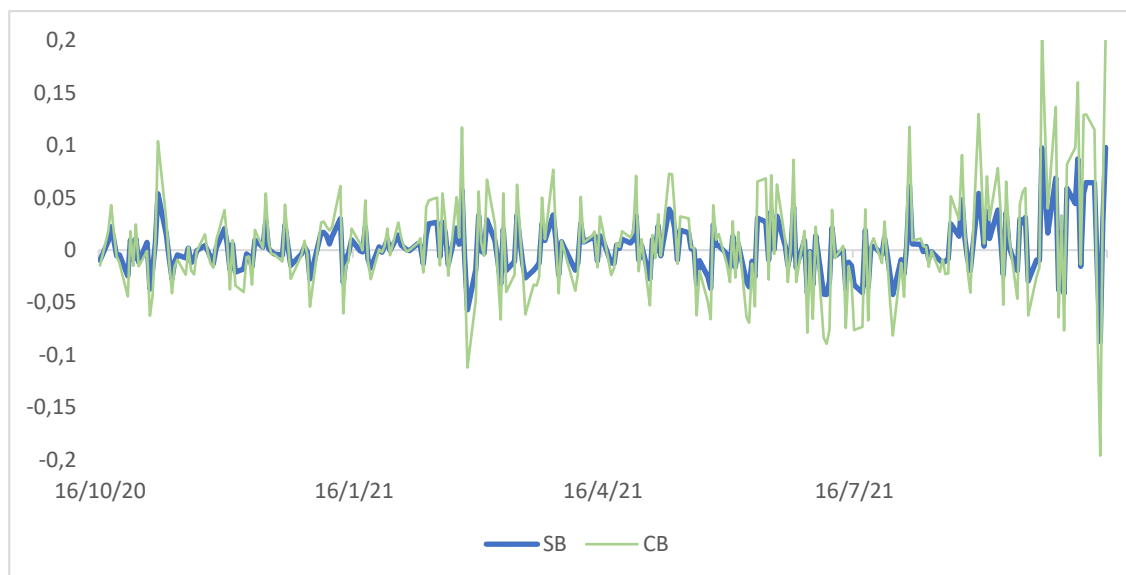
Figure 2 - Daily YTM: SBs and CBs

To sum up, the descriptive analysis of our sample of SB and CB highlights differences in yields and in some of the matched characteristics, and this call for the next multivariate analysis of the determinants of the yield spreads.