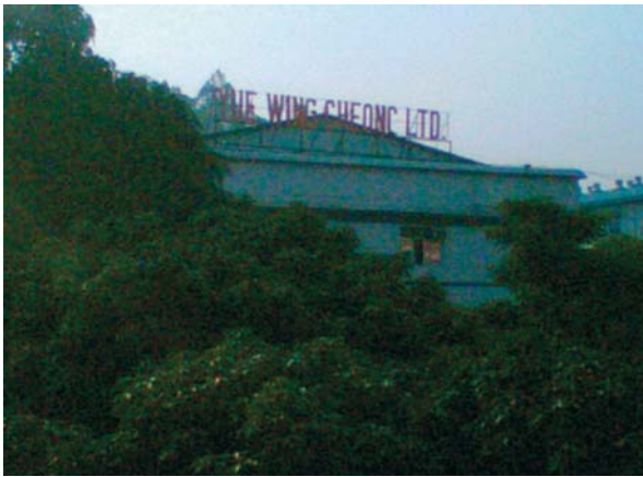
The bag manufacturing plant based in Longgang District, Shenzhen