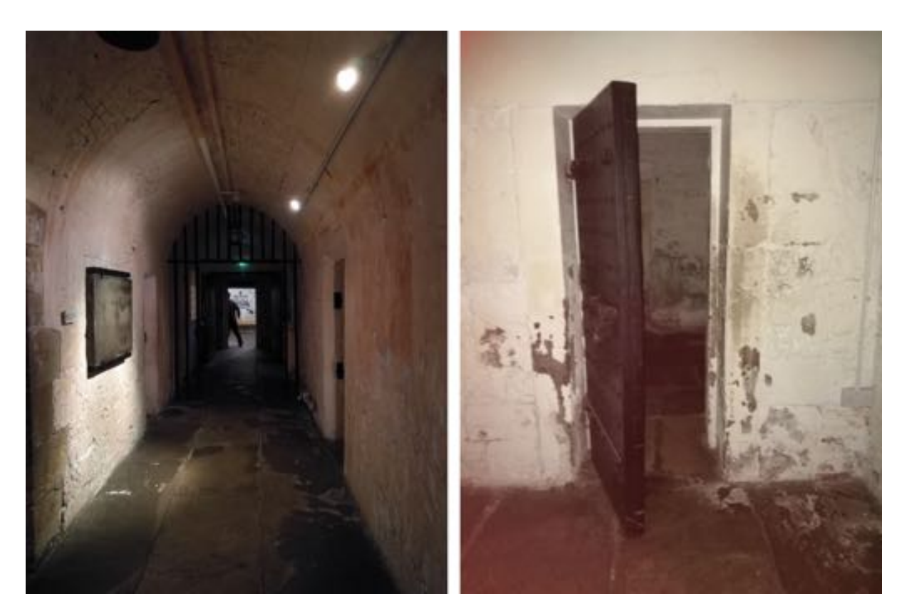
Fig. 5. Left: Wayfinding inside York Castle Museum, a dark gaol corridor with cells off to each side. Photograph by N.Smith [Public Domain]. Right: The doorway of a cell in York Castle Museum gaol. Photograph by N.Smith [Public Domain].