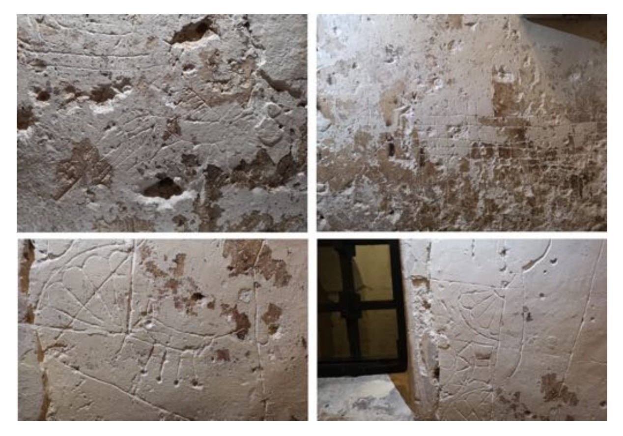
Fig. 6. Clockwise, from top left: Marking making in the gaol cells at York Castle Museum. An ornate bird, the gaol itself, hunting dog, architectural detail.

the torch (a modified hardware assembly containing a torch and an HTC Vive controller) through the space. The experience was implemented within Unity with users able to activate audio files by pointing the HTC Vive Controller at an audio source aligned with the graffiti in the room. Pointing at an audio source would cause a sound to quickly 'fade in' while moving the controller away would cause it to quickly 'fade out' again. Directional sounds were produced using a set of surround sound speakers hidden within the room. The experience was powered by a PC placed outside of the room.