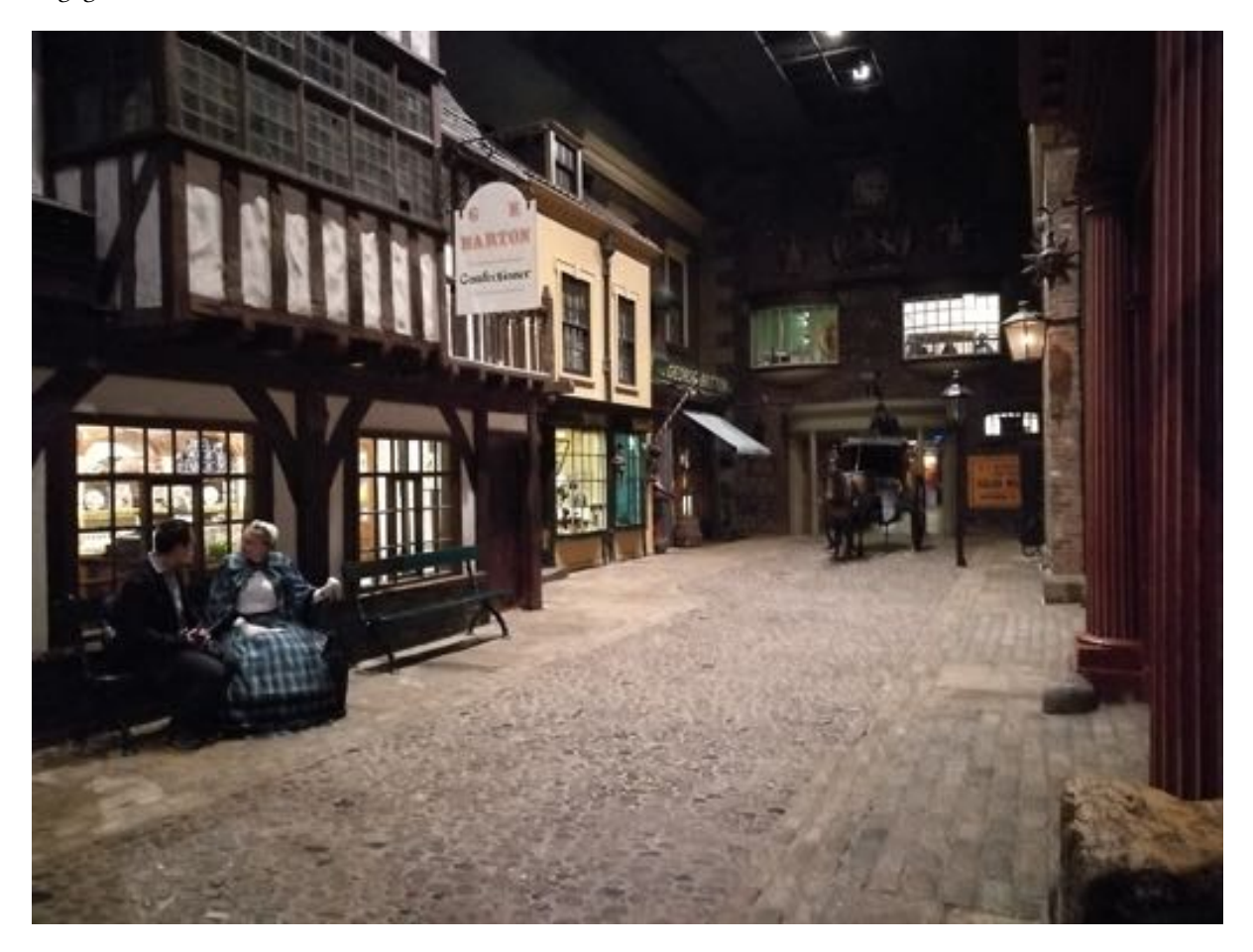
Fig. 4. A general view of Kirkgate Victorian Street at York Castle Museum.

in the museum in order to gain a more in-depth understanding of the challenges presented by the setting and the history of the building. In particular, the team focused on conducting visitor observation in the Kirkgate part of the museum (figure 4). This is a reconstructed Victorian street with original shop fronts on display in which costumed interpreters walk amongst museum goers engaging in conversation. Shop fronts act as open storage and consequently artefacts on display have little associated labelling. Interpretation is provided via live engagement with staff and volunteers.