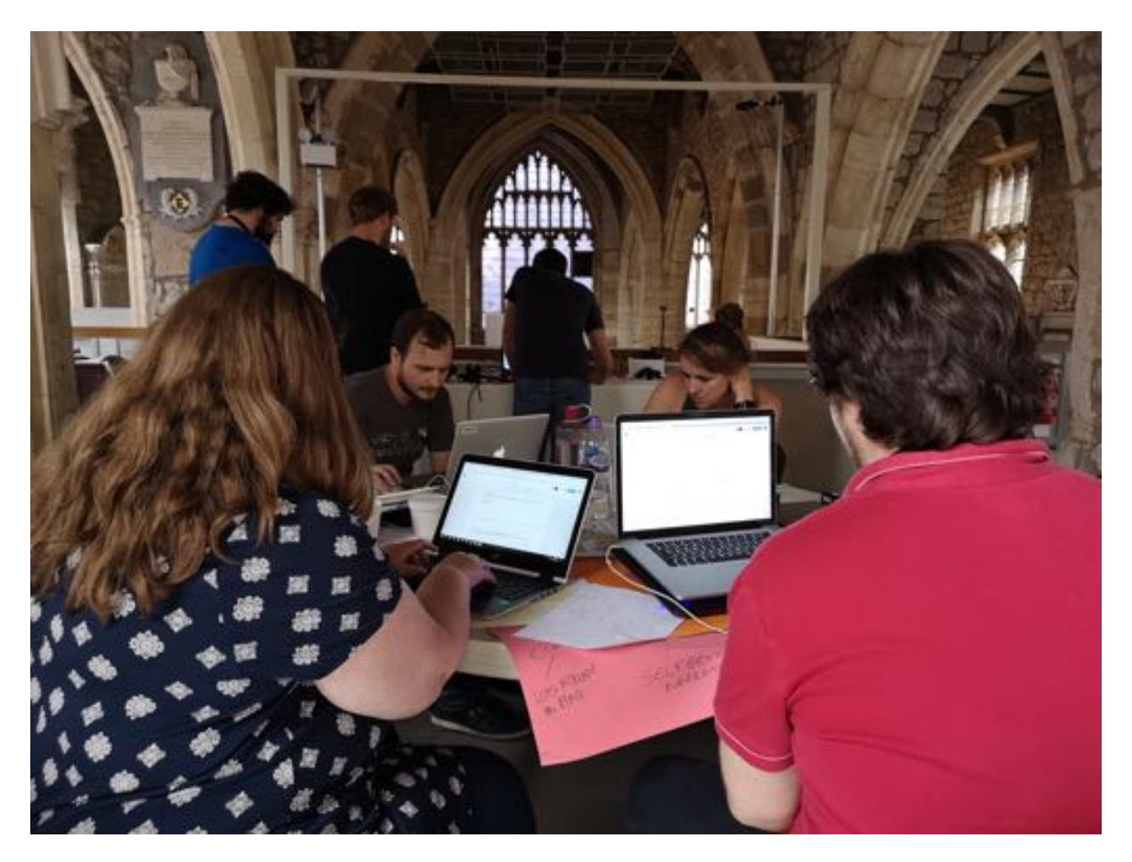
Fig. 3. Attendees working on their prototypes at workshop 2, within the setting of York St. Mary's, York Museums Trust.

prisoners. The workshop provided an important opportunity for staff members from across the organisation to take a meaningful creative role in the production of a new installation.