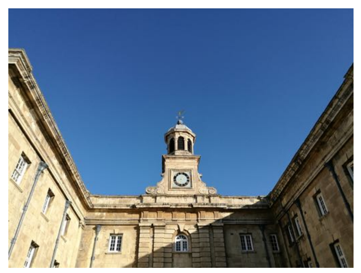
Fig. 1. A general view of the York Castle Museum.

enabled the research team to explore the opportunities and challenges of immersive media for archaeological storytelling in museums and the interplay between immersive experiences and artefactual and architectural material culture. This part of the project enabled us to investigate the narrative affordances of immersive media and to consider how (when delivered through different forms of immersive technology) immersive experiences might be meaningfully integrated into an historic environment. A primary goal of the project was to explore the interplay between immersive media and historic buildings for delivering new forms of museum experience. The primary research question for this part of the project was: