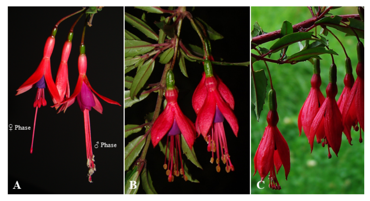
Figure 1. A. Flowers of Fuchsia regia in female (left) and male phases (right). B. Flowers of F. campos-portoi . C. Possible hybrid ( F. regia x F. campos-portoi ) photographed in 2009, near the IBAMA base ao the Itatiaia National Park.

Studies were undertaken at the Itatiaia National Park (Parque Nacional do Itatiaia, 22° 22' 31" S and 44° 22' 39' 44" W) between September 2010 and January 2012. The Park embraces part of the territories of two Brazilian States: Rio de Janeiro (Municipalities of Resende and Itatiaia) and Minas Gerais (Municipalities of Alagoa, Bocaina de Minas and Itamonte). Altitude varies from 500 to 2791 meters a.s.l. (at the Pico das Agulhas Negras, the highest point). The region presents a mosaic of forest and rupicolous-grassy vegetation subtypes, all inserted within the Atlantic Rain Forest (Mata Atlântica) Biome. The climate is mesothermic