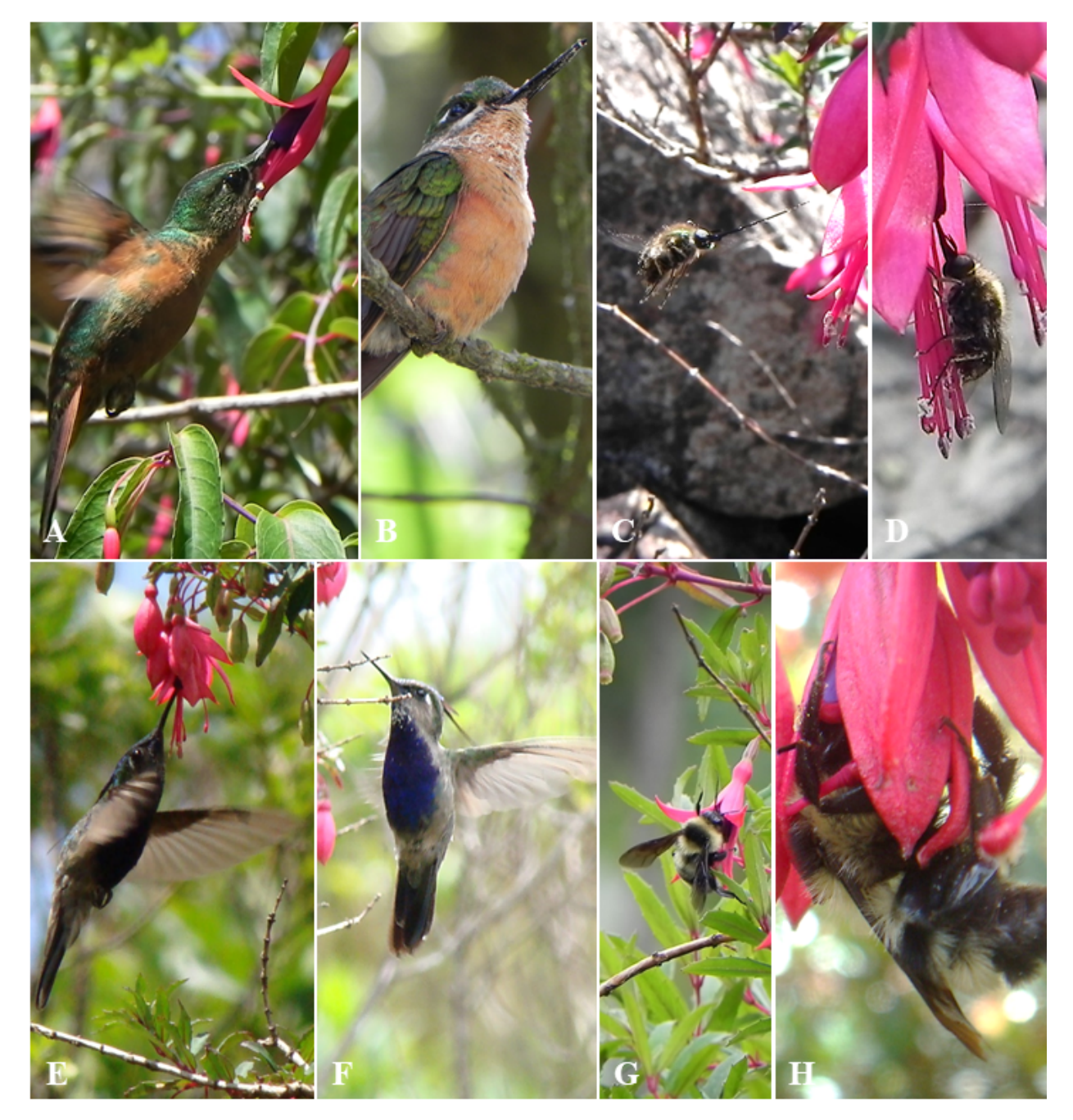
Figure 2. A-D. Pollinators of F. regia . A and B. Clytolaema rubricauda (Trochilidae) showing large amounts of pollen of F. regia on the throat (B). C and D. Acroceridae flies. E-H. pollinators of F. campos-portoi . E. and F. Stephanoxis lalandi (Trochilidae). Notice the pollen onto the throat (F). G. and H. Bombus brasiliensis (Apidae). Notice the stigmatic surface touching the bee's ventral region (H).

and stigma) are considered pollinators. Emphasis will be given to these animals and their behaviour at the flowers. Animals that do not contact the flower's fertile parts are considered non-pollinating floral visitors and their behaviour will be mentioned briefly. The pollen in Fuchsia is characteristically "beaded" (Figure 2B and F), this is, agglutinated by large viscin threads (Berry 1989). Consequently, it is macroscopically visible and large amounts of pollen can be noticed onto the pollinators (see Results and Figure 2A-D and E-F), a fact that much facilitates the identification of actual pollinators either in