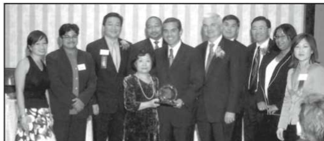
Sweatshop Watch and Garment Worker Center receives the Community Partner Award from longtime ally the Asian Pacific American Legal Center (APALC) at their annual dinner on October 20, 2005. Los Angeles Mayor Antonio Villaraigosa and board members of APALC were also present.

ORDER YOUR "NO SWEATSHOPS: INFO & ACTION KIT!" WWW.SWEATSHOPWATCH.ORG (213) 748-5945