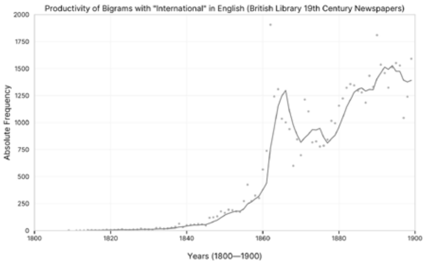
Figure 3.2 Annual number of unique bigrams with ‘ international ’ as the first word in nineteenth-century newspapers in the British Library. Gale Nineteenth Century British Newspaper Collection.

Figure 3.3 portrays fourteen groups of words that are analysed for the whole nineteenth century. Similarity in distribution often entails some sort of semantic or thematic similarity, but the division into a particular number of groups leads to groups that are regarded as similar in distribution, but do not necessarily appear to naturally belong together. Some groups seem more coherent than others. We explored the same data with different numbers