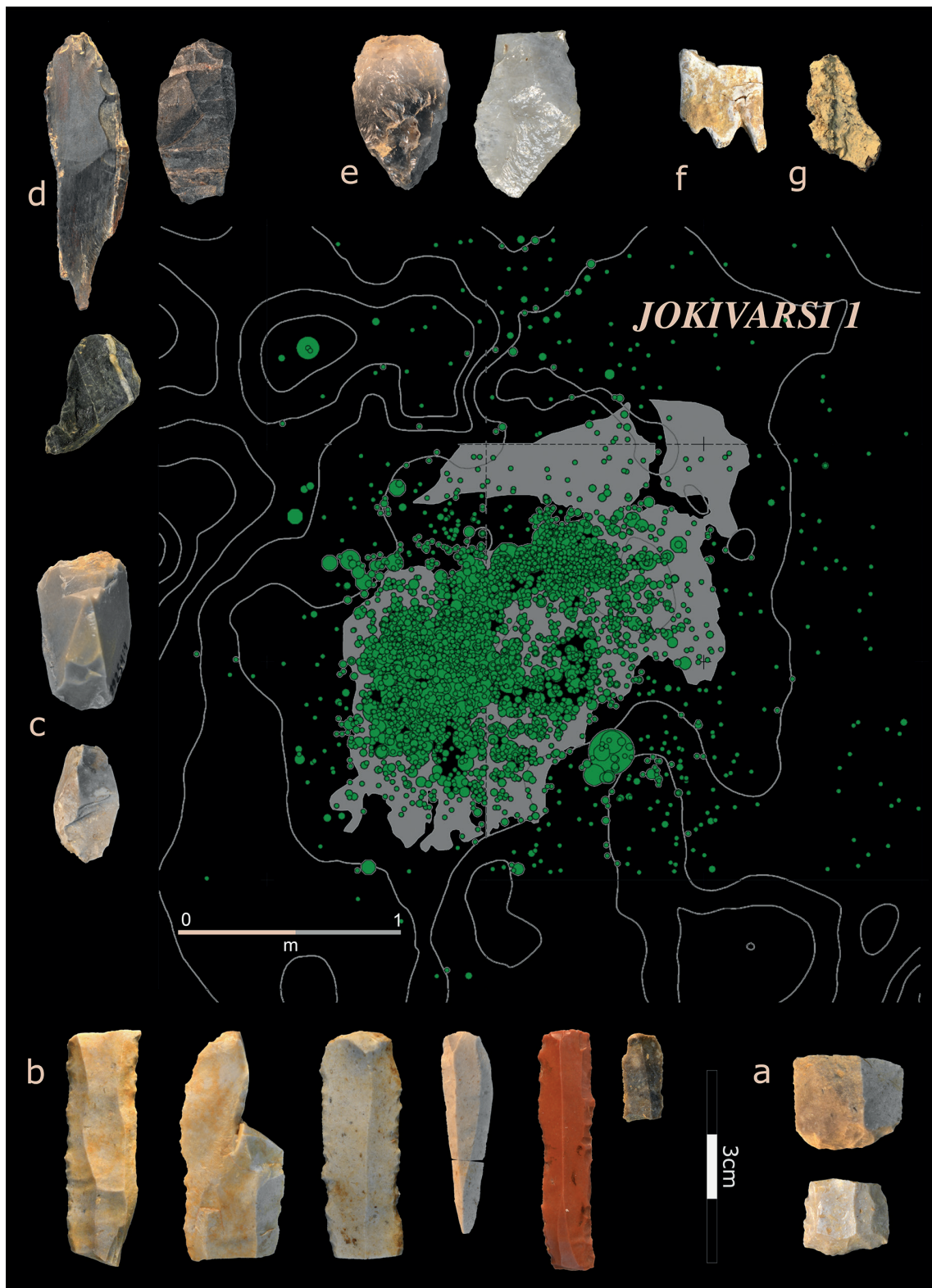
Figure 6.3. Find distribution map from the 2011–2012 Jokivarsi 1 excavation (green dots indicate finds, grey areas indicate organically stained soil, interval between surface contours is 10 cm) and a sample of finds: A – endscrapers on flint blade. B – flint blades and retouched blades. C – flint bipolar-on-anvil cores. D – flakes and tools in black chert, of which some contain lidite. E – quartz flakes. F – fragment of a burnt bone artefact. G – piece of birch bark pitch. Photos and image composition M. A. Manninen. Map P. Pesonen.