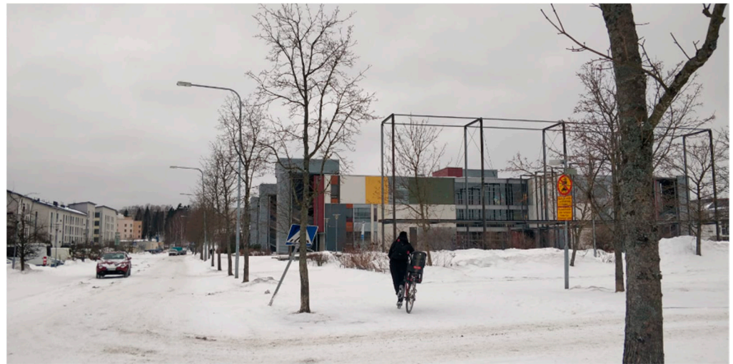
Figure 1. With the photograph, Student 25 wants to emphasize the ecological lifestyle of people living in the Viikki region.

using photography, but the focus is on the written text. The role of the two photographs (Figures 1 and 2) presented here is, therefore, only exemplary.