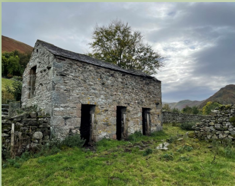
Field Barn in Martindale

There are a huge range of vernacular Lake District buildings, all of which historically have performed crucial functions on farms. As farming has changed the original use has become redundant and these buildings can fall into disrepair. Repurposing buildings is not uncommon within farm businesses. Barns, in particular, can be sensitively adapted and reused for diversification opportunities such as: bunkhouses, small business venues or low impact visitor facilities. In doing so we can retain the external cultural fabric of our landscape, improve the farm economy and offer sanctuary for biodiversity such as bats, nesting birds and some more of the more unusual plant groups, like lichens or ferns.