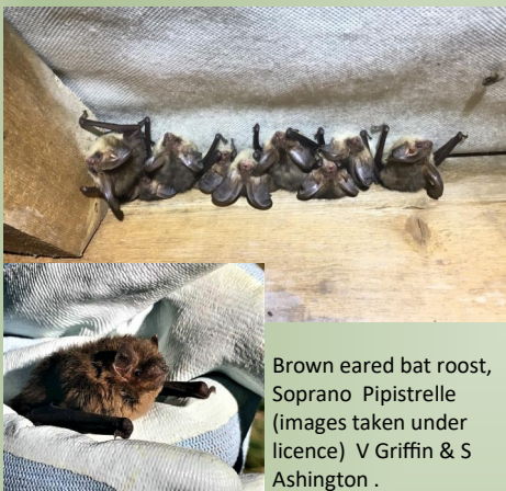
Brown eared bat roost, Soprano Pipistrelle.

Consequently, practices which intensify farming practice are strongly discouraged and are often the focus of agri-environment schemes. Hence silaging, applying slurry or NPK are less welcome. Finding the balance between fodder production and biodiversity management can therefore be complex.