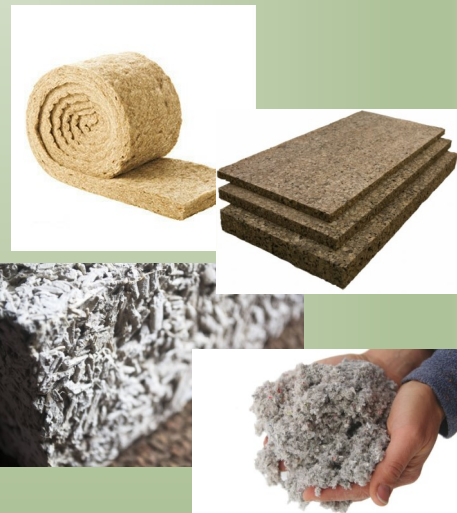
[Wool: top left; cork: top right; hempcrete: bottom left; cellulose: bottom right]

Retrofitting traditional buildings, whether farmhouses or barn conversions, using natural, sustainable materials and techniques, will save carbon and money on bills. An example of this is using carbon neutral insulation (wool, cork, hempcrete or cellulose) rather than rockwool, expanded polystyrene or fibreglass which emit significant carbon in their production & transport.