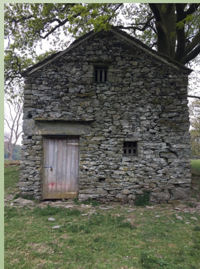
Hog house above Waterhead, Ambleside

Most are now used as outlying stores for fencing materials and so on. Maintaining their structural integrity is key to retaining the way our cultural landscape looks. Additionally, like barns, they provide ideal locations for bird and bat boxes.