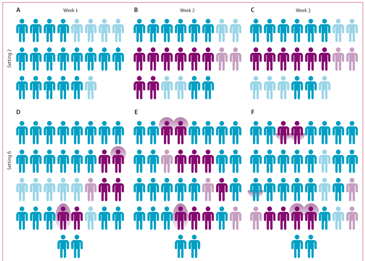
Figure 3: Acquisition of emm1 (M1 UK ) and emm3.93 strains of Streptococcus pyogenes by classroom contacts in settings 2 (year 1) and 6 (year 2) Each icon represents an individual child, grouped by week of swabbing, in week 1 (A), week 2 (B), and week 3 (C) in setting 2 and in week 1 (D), week 2 (E), and week 3 (F) in setting 6. The colour of each icon indicates the throat swab result: negative (blue), outbreak S pyogenes strain (dark purple), non-outbreak strain or genotype not confirmed (pale purple), or participant not swabbed that week (light blue). A purple glow around the icon's head indicates a positive cough plate, around the icon's hands indicates positive hand swab, and around the whole icon indicates both a positive cough plate and hand swab. Classroom contacts had throat swabs taken on a weekly basis for at least 3 weeks after a case of scarlet fever was identified.

from week 4 to weeks 7–8 (table 2). None of the 18 child contacts swabbed in week 16 were carrying S pyogenes (table 2). Compared with carriage of the outbreak strains, median carriage of non-outbreak S pyogenes was 2.8% (IQR 0.0–6.6) during the study. Transmission of the outbreak strain appeared to be particularly intense in setting 2 in year 1, where eight (44%) of 18 children swabbed were infected with the outbreak M1 UK strain in week 2, in addition to two household contacts, and six (38%) children were infected with the outbreak strain in week 3 (figure 3B; appendix p 6). Overall, across all six settings, more than half of eligible children participated in the study (median participation rate 52.5%, IQR 43.7–65.8; appendix p 6).