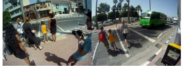
Figure 3. Snapshot of child having pressed the button and waiting for the green light (left). Snapshot of child crossing (right).

recorded throughout on data sheets, concerning all steps of the procedure and finally the overall success/ failure of the attempt. The sessions were also videotaped for reference and further study. Children repeated this over the course of four (4) days to ensure that they had reasonable time to learn