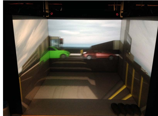
Figure 1. The VR CAVE and its four projection screens, shown running the pedestrian crossing application.

children have been diagnosed with ASD as a primary diagnosis. The children attending First, Third and Fifth Grades were diagnosed also with ADHD and the children in the Fourth Grade with Mental Retardation. Based on the District Committee of Special Education (Limassol, Cyprus) they all attend a special education unit in an inclusive setting school. The participation of children with ASD in this experiment was undertaken after the written approval of