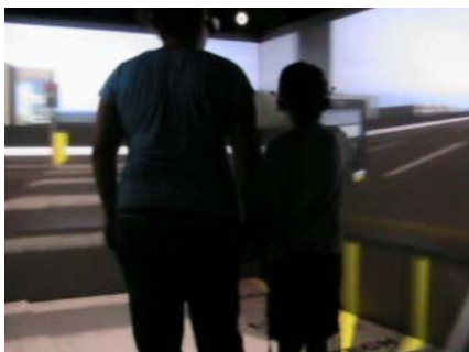
Figure 2. A child participant with its educator in the VR CAVE

Each child had four (4) trials, attempts to cross the pedestrian crossing in the VR CAVE, following the correct procedure, as explained to them. Observations were