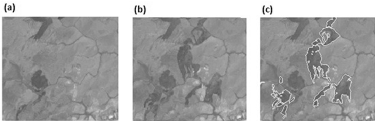
Figure 1. Delimitation of burned area by using a subset of Landsat image 005/056: (a) shows the first acquisition Landsat image of the pair (2003/01/06), (b) shows the second acquisition Landsat image of the pair (2003/01/22) where the burned area can be visually identified, (c) shows the burned area identified between acquisitions

According to previous studies, the sources of error can be associated with spatial and temporal