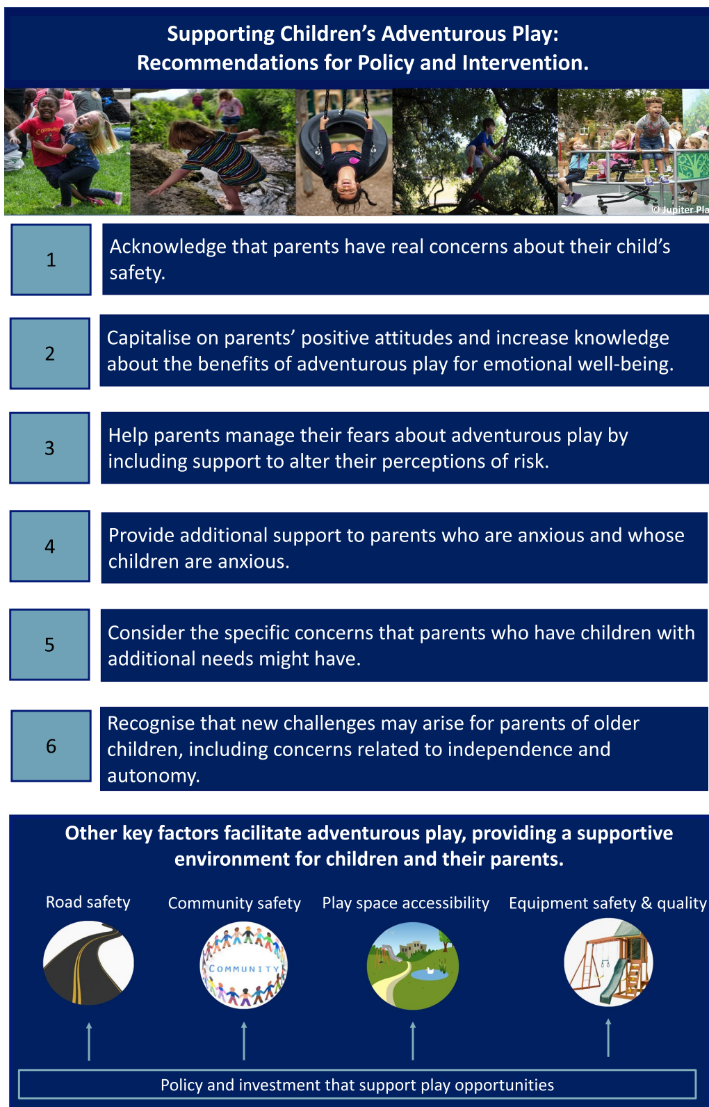
Fig. 2 Recommendations for policy and interventions