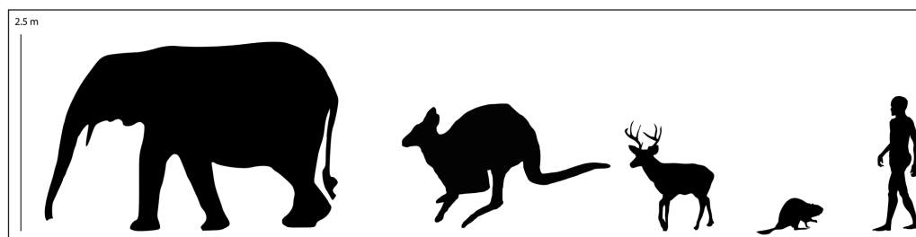
Figure 2: Selection of sizes of prey hunted with wooden spears in ethnohistoric and ethnographic literature in comparison with an average male H. sapiens . From left: African forest elephant ( Loxodonta cyclotis ), kangaroo ( Macropus giganteus ), white-tailed deer ( Odocoileus virginianus ), beaver ( Castor canadensis ). Image composed by the author using silhouettes from phylopic.org. Loxodonta cyclotis silhouette created by Richard Ruggiero, vectorised by Zimices, available with a Creative Commons Attribution-ShareAlike 3.0 Unported license: https://creativecommons.org/licenses/by-sa/3.0/ .

jaguar, capybara, wild pig/boar, and depending upon which bear species were hunted by the Kaska, possibly also the American black bear (see Table 2 for scientific species names). Size Class 3 animals (113–340 kg) include the tapir, which inhabits forests and rainforests in South America (Alvarsson 1988), and possibly the grizzly bear if hunted by the Kaska (Honigmann 1954). Size Class 4 animals (340–907 kg) include crocodiles hunted in the Kimberly region of Western Australia (Hardman 1889) and possibly dugong hunted by the Tiwi (Goodale 1971). The African forest elephant, reportedly hunted in the past by Mbuti using wooden spears, falls between Size Classes 5 (907–2,721 kg) and 6 (>2,721 kg) (Carpaneto & Germe 1989 and references therein; Turnbull 1965). There is a lack of clarity in sources consulted (see accompanying dataset) regarding which technologies the Bubi in Bioko used to target different prey, and so the prey they potentially exploited using spears ( Table 2 ) should be treated with caution.