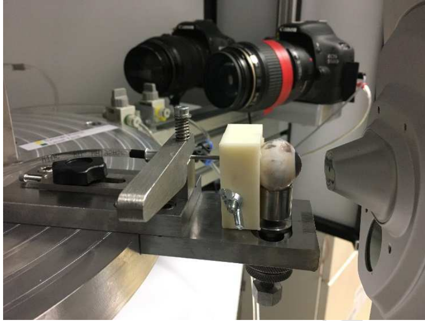
Figure 2 Test rig showing the eye sitting on a rigid support and supported from the back while being connected to a syringe pump that controls its IOP. CorVis ST is placed at a distance to enable its automatic trigger.