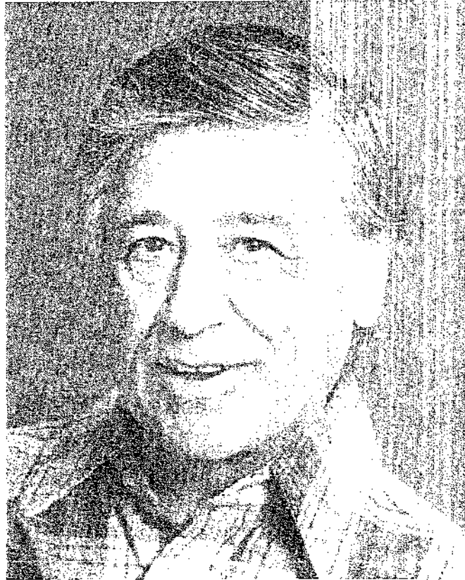
Labor Organizer Cesar Chavez

students with only an open briefcase sitting on the desk at the front of the classroom. There was no professor. “Who was going to teach these students?” cried out a voice on the commercials. It may sound very idealistic today, but I decided to answer Kennedy’s challenge by becoming a college teacher. I have never regretted it.