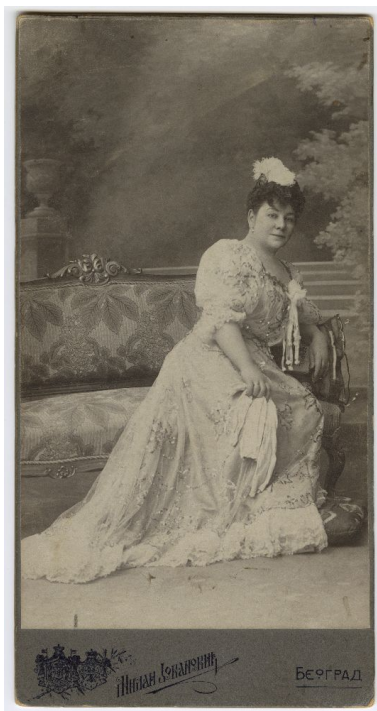
Studio portrait of actress Zorka Todosić