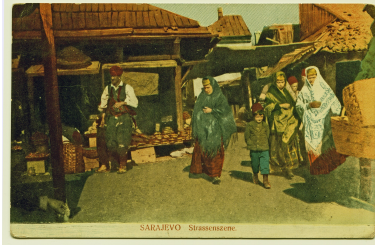
"Sarajevo / Street Scene"