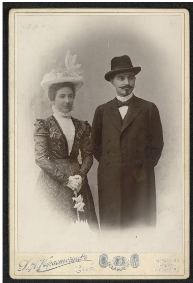
Studio portrait of the Ilkov family