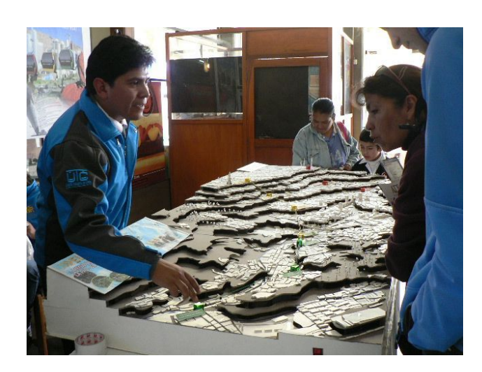
Figure 2: Consultation on new cable car public transit system for La Paz