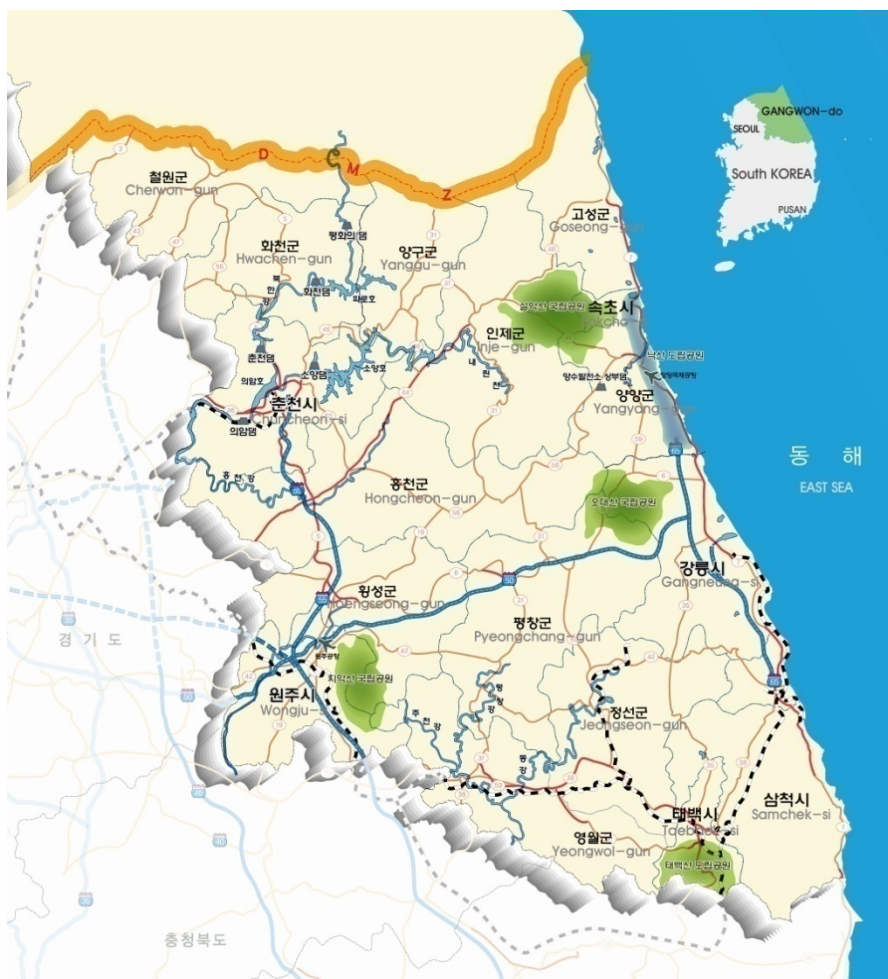
Figure 1. Map of Gangwon Province

As shown in the map below, the Gangwon province is located east of the Seoul Metropolitan Area (SMA) and bordered with North Korea along the DMZ (Demilitarized Zone). It is relatively large in physical size with 16,894Km 2 or 16% of Korea's total land area, but rather sparsely populated with only 1.52 million people or 3.1% of the nation's total population as of 2006.