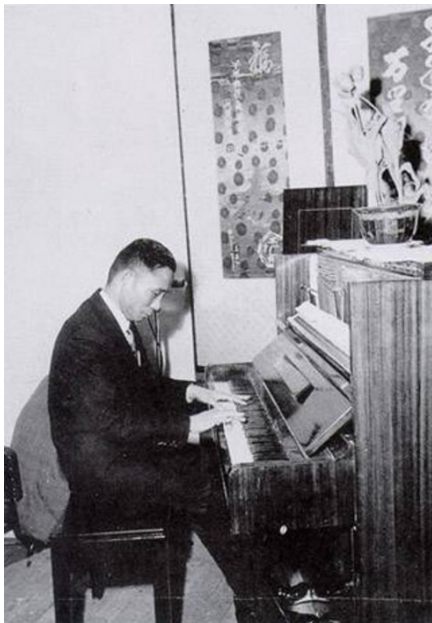
Park at the piano. (Cyber Park Chung Hee