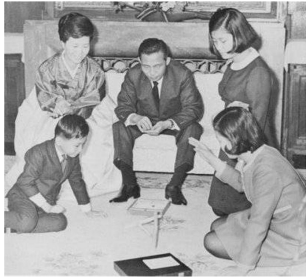
Park Chung Hee with his wife and children, playing yunnori on a New Year's Day

In the final section below, I will discuss what these recollective representations of Park reveal about the collective wishes and longings of the Korean public. They imply competing popular visions of a desirable society.