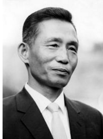
Park Chung Hee as a patriotic and modest leader

To show Park's disinterest in personal luxuries and wealth, the popular texts discuss examples from his life prior to his presidency. During his service as an army general in the postwar decade (1953-1963), it is reported that he did not appropriate army resources or accept bribery for personal enrichment. Unlike most generals of the era, who led luxurious lives thanks to bribery and corruption, Park is reported to have lived in humble rented houses. Even when he was the commander-in-chief of the military supplies base in Pusan (1960), where military supplies from the U.S. Army were nationally distributed, he allegedly did not accept the numerous kickbacks offered by army purveyors. Because this base involved ample material benefits in a war-torn country, high-ranking officers there were particularly close to the political elite. These military officers used their control over base resources to bolster the ruling Liberal Party during each election, in exchange for their affluent lifestyle and political influence. Park reportedly refused to comply with the conventional practice of corruption among high-ranking military officers and did not play the political game with them; as a result, his assignment ended abruptly after six months, despite the fact that his tenure there was supposed to last for two years. 45