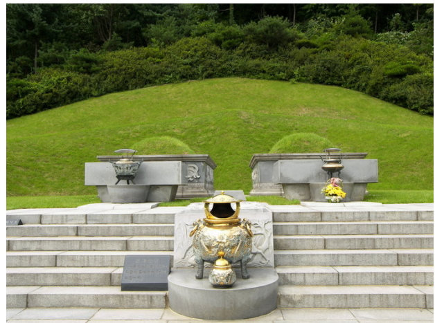
Tomb of Park Chung Hee

published to eulogize his “revolutionary contribution to 5000 years of Korean history.” 16 During Kim Young Sam’s rule, efforts to commemorate Park expanded beyond the narrow circles of his family, his memorial society, and his hometown. In April, 1997, to commemorate its 77th anniversary, Dong-A Daily conducted a survey on the most competent president in Korean history. 75.9% of respondents chose Park whereas Kim Young Sam, the president at the time, received the support of only 3.7%. In late 1997, the government’s Public Relations Office (kongboch’ŏ) conducted a national survey on public consciousness and values and found that Park Chung Hee had become “the most respected historical figure,” ahead of the Great King Sejong (who invented the Korean alphabet and has been lauded as the paragon of a sage Korean ruler) and Admiral Yi Sun-sin (whom Park had elevated to the position of “sacred hero” for his defense of the Korean nation from Japanese invasion during the late 16th century). 17