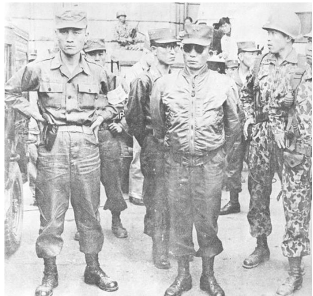
Park Chung Hee during the military coup in May 1961.