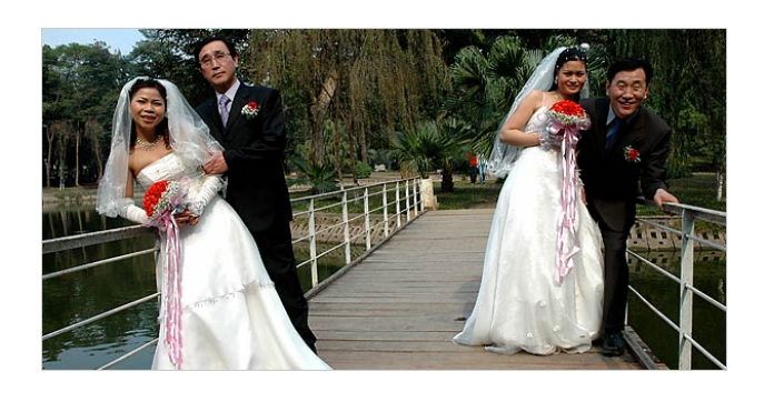
Korean men marry Vietnamese women in Vietnam

The proportion of intermarriages in total marriages in Korea has jumped more than ten-fold since 1990, accounting for nearly 14 per cent in 2005. This coincided with the growing number of migrant workers in Korea (see Table 2). The soaring number of international marriages is also due to a significant growth in the number of "picture brides" from abroad.