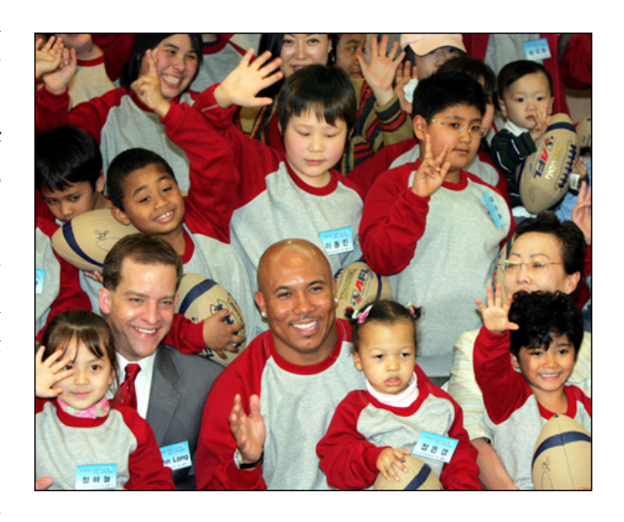
Bi-ethnic and bi-racial children in Seoul

include a section on bi-ethnic/bi-racial children and multicultural families, highlighting the need to understand their cultural backgrounds and to develop more tolerant attitudes toward them. This is a major change from the emphasis on ethnic homogeneity, which presented Korea as a consanguineous community comprised of the descendants of one common ancestor. Major television networks have started to program shows featuring immigrant brides and multicultural families. Evidently, Korean society is starting to implement measures to accept the multicultural reality, at least for those who share "Korean blood."