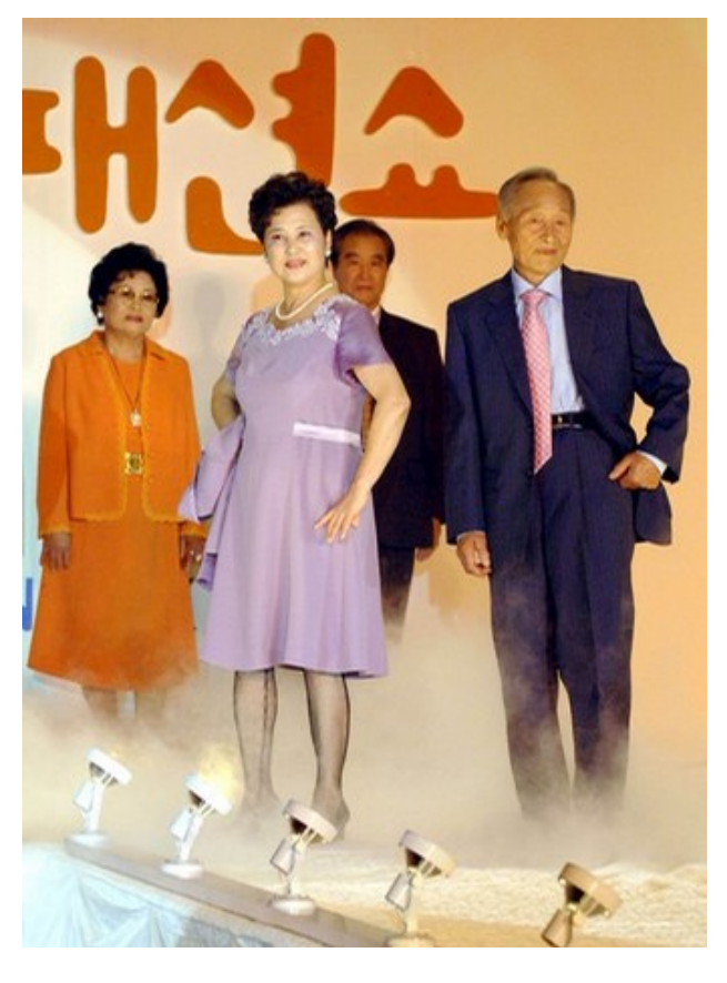
Korea's aging population

Korea is one of the world's most rapidly aging societies and its fertility rate is falling at a record pace to a level well below the replacement rate of 2.1 children per family. In 2000, Korea became an "aging society," in which 7 per cent of the population consists of the elderly (those 65 years or older). If current population trends continue, the country will transition to an "aged society" in 2019, when 14 percent of the population will be elderly. Korea will become a "superaged society" by 2026, when the elderly would make up 20 per cent of the population.